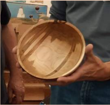
Ambrosia maple bowl