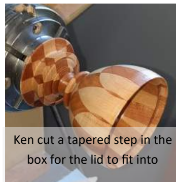
Ken cut a tapered step in the box for the lid to fit into

Next he determined where to part the top for the lid and set it aside. Ken then shaped most of the outside leaving the base for later to avoid putting too much