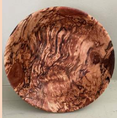
Silver Birch bowls finished with Tried & True