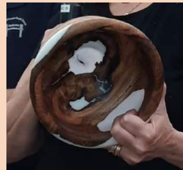
Medium size bowl turned from red or white oak to which she added a white resin.