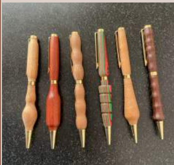
WIT pens showed originality! The COA leaders loved the unique shapes and also found them very comfortable in the hand!