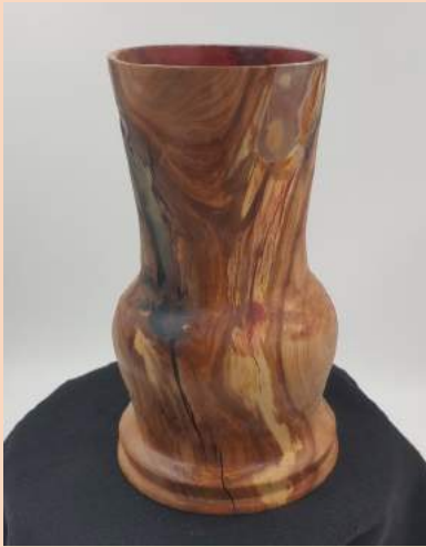
(top) Chinese Elm arched bowl (bottom) Donald Wyman Apple & Resin vase