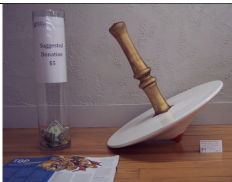
Wally's giant top