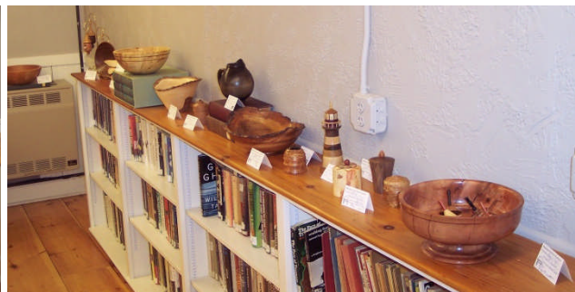
More items for sale