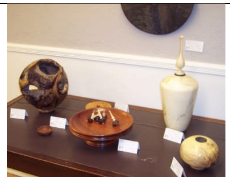
Tops (by Wally) and more display items