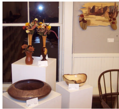
Some of the items for sale