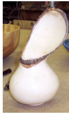
Wally had a natural edge pear turning in this photo and a two year old natural edge bowl shown here which has darkened.