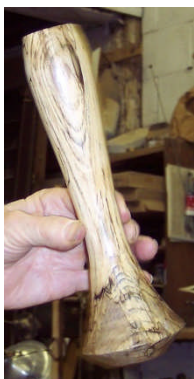
Ben shows us another weed pot of Spalted Maple and a Spalted Maple bowl.