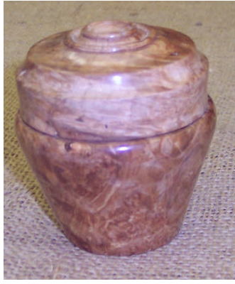
Jeff Keller – a returned Spalted Maple box w/a chip on the upper rim and some marks that needed to be removed. It is finished with wipe on poly.