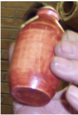
Skip Brown showed us a cedar box he colored with rouge polishing compound.