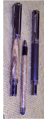
Bob Allen had these magnetic pens (featuring magnetic caps). Pictured is a rollerball turned from Ebony, one from Zebrawood and a stylus from Zebrawood.