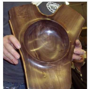
Joe Feeny showed a Black Walnut crotch bowl with wings.