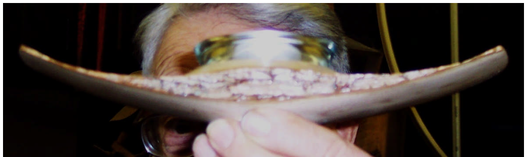
Ben has a small oak bowl and a Catalpa Tea Light holder