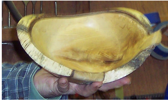
Bill Dooley showed us a piece of Denker wood, a natural edge bowl without the bark from Birch. It had two feathers in the turning. He also showed a winged bowl with some pretty good figure -also Birch.