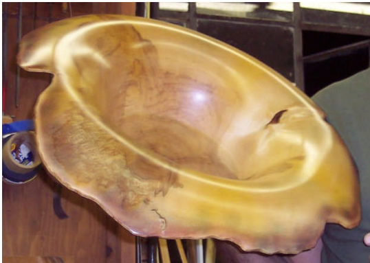
Nigel showed us what looked like another of his large bowls but when he turned it around, it had a wire for attaching to a wall as a wallhanging. It is 26" in diameter turned from maple and dyed. " It weighs just over 3 pounds now", Nigel said.