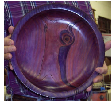
Ken holds a yellow pine bowl which he dyed with black ink on the back and then dyed the rest purple. Interesting effect