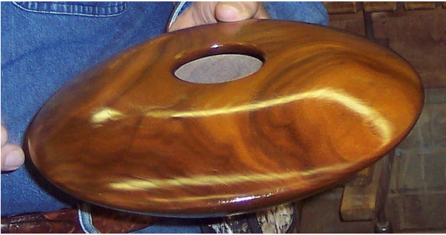
Steve has an impressive piece of figured walnut hollowed very thinly. If you look real close, you can just see the joint where the top and bottom halves were glued together. He also showed two pens made from antler.