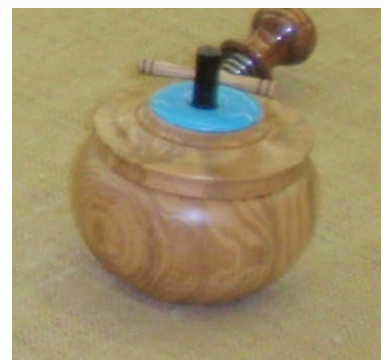
Jeff showed a box of Elm(?) with an oriental style of Ebony and a lid of the same Elm (?) with burned rings for decoration. The blue stone is Turquoise