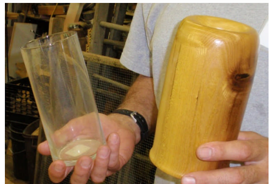
Nigel holds a turned cover for a glass vase. The wood is Mulberry.

And finally Steve's showed us a small Box Elder box