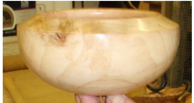
Ian is holding a small Maple bowl with an inverted edge.