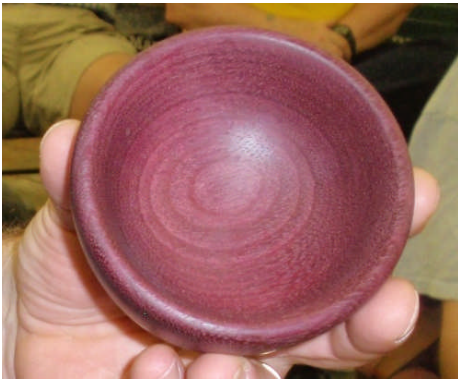
Bill Roach holds a small Purpleheart bowl with an oil finish.