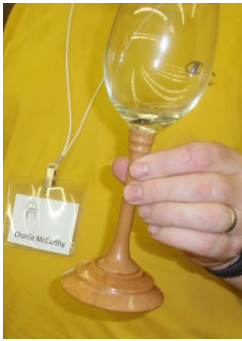
Charlie McCarthy holds two wood stemmed wine glasses turned following Ian's demo presentation from last month's meeting. The off center stem is particularly impressive. Nice job Charlie !