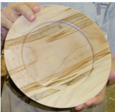
Sid showed us this Ambrosia Maple plate. Nice form.