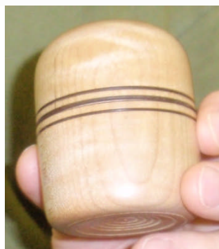
Bill Dodge has a small box with some decorative rings turned from a piece of Maple