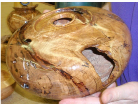
Andy has a Maple hollowform with feet with some serious figure to it. He formed the feet by turning a ring on the bottom and cutting away material in between after they had been indexed. He used a Dremel with Sabertooth bits to remove material for this.