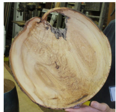
Ken Whiting holds a piece of Sugar Maple from an old tree the town of Norwell removed from my front yard. It shows an interesting feather formation along with an artful hole to let items spill out from. Ken used Watco oil finish on it and burned the edge.