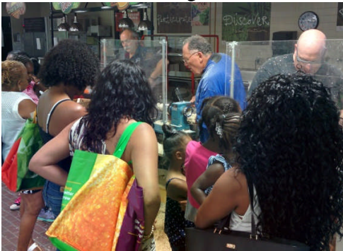
Our exhibit drew a crowd for most of the day as is evident here.