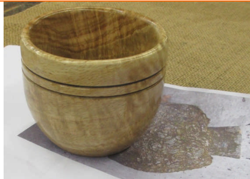
Peter Soltz had an Ambrosia Maple plate and an Ambrosia Maple cup