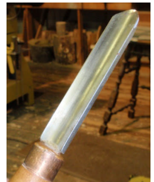
Continental spindle gouge

On the lathe was a cylinder waiting to be turned into a weed pot. Bob began by marking it off into thirds with a pencil. He said it is best to always work downhill against the grain riding the bevel. A weed pot with a glass tube is a bud vase –and worth more money if you are selling it. At the clinic we will also make a finial and start to use your skew (which will be a topic for a future clinic)