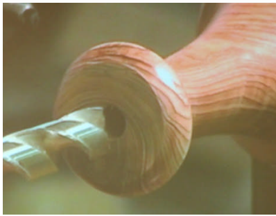
Drilling a larger hole for the test tube