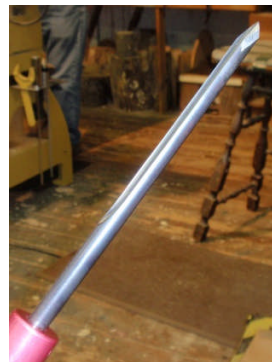
Detail gouge, long wing, sharp point