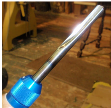
Common spindle gouge by Sorby that has been rehandled