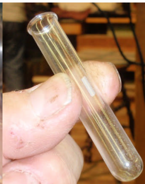
Pictured is the test tube for the weed pot to turn it into a bud vase.