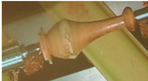
The piece has been turned around and remounted on a point used as a drive center