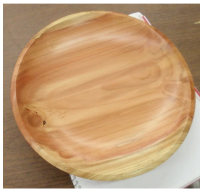
Jeff's shallow bowl turned from Hinoki which is Japanese Cypress. It is finished with wipe on poly.