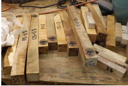
Assorted tool handle and pen blanks

Tee Shirts $16.00 $2.00 More for 2X and larger Polo Shirts $27.00 $2.00 More for 2X and larger