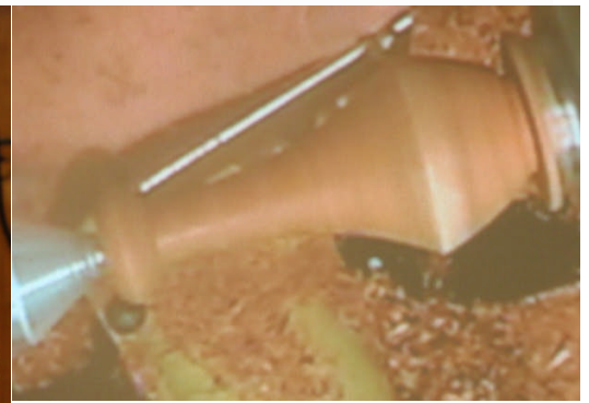
Showing the front half finished and the back has been shaped.