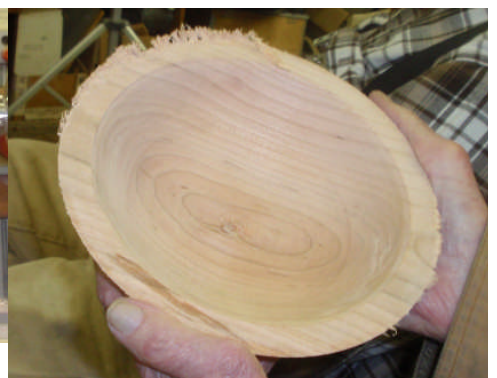
The finished cored second piece