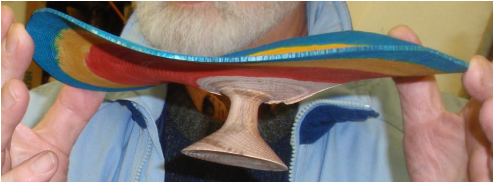
Andy holds a shallow, thinly turned compote from Jamaica Plain Oak which he dyed with an aniline water based dye.