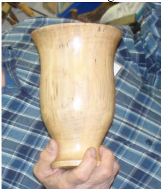
Pablo also had an Elm vase with a foot which he turned for design reasons.