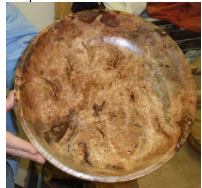
Pictured is a Maple burl with spalting turned by Jeff.