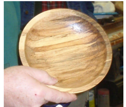
Charlie McCarthy holds a desk lamp turned off center with a battery for the bulb. The lamp top detaches. He also showed an off center turned candlestick; some bangles with copper inlay pictured here; and a small bowl.