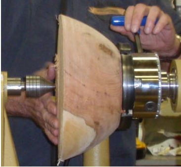
He mounts the blank on lathe and attaches a small faceplate for re-centering if necessary.

Steve said that you can buy a laser that can be set up to follow the tip of the cutter as you proceed if you wish. "The bigger the diameter of the blank, the slower the speed". Chips clog the opening up so you need to proceed slowly and keep them cleaned out.