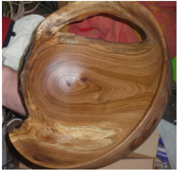
Steve holds a large Walnut bowl with a triple crotch. He used Bush Oil as a finish.