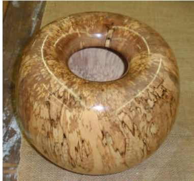
- Nigel's spalted Maple natural edge inverted form.