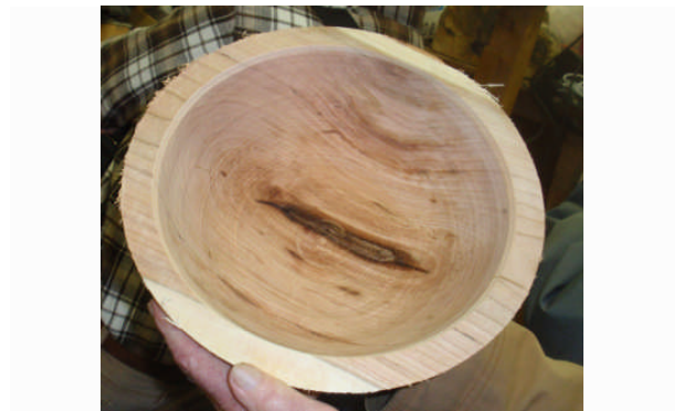
First cored piece up close.