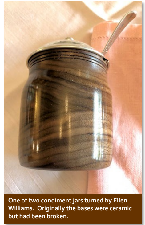
One of two condiment jars turned by Ellen Williams. Originally the bases were ceramic but had been broken.