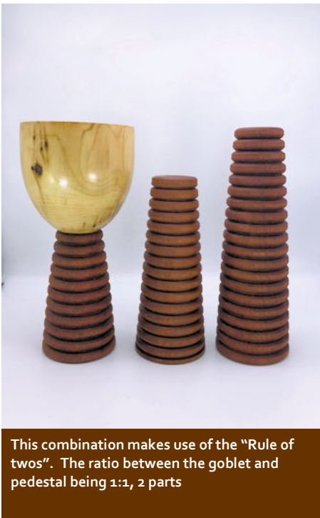
This combination makes use of the "Rule of twos". The ratio between the goblet and pedestal being 1:1, 2 parts