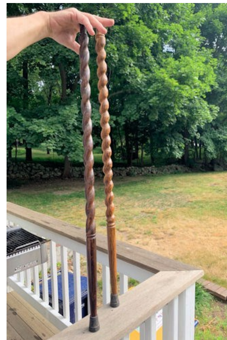
On the left is a double twist turned last year. On the right is a single twist recently completed and awaiting a handle