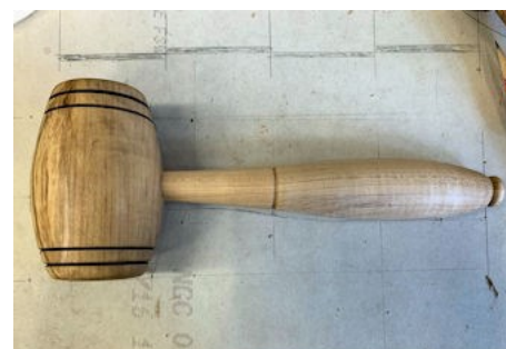
The completed gavel alongside the original drawing Bob did showing the proportion of the handle to the head.