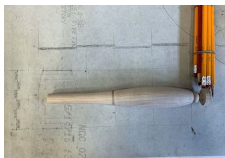
Pictured is another illustration Bob drew showing the proportion of the length of the handle and the design changes as it was turned from left to right