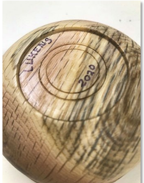
On the bottom he used a mortise rather than a tenon to hold it. He finished it with tung oil.