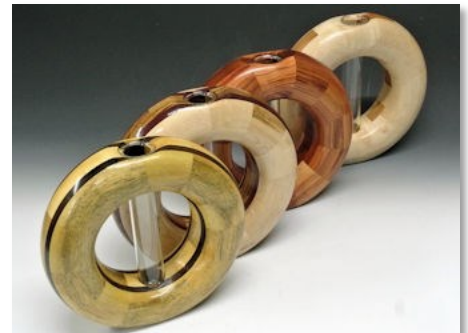
Pictured are several colorful rings courtesy of Wayne Miller. They are actually weed pots and each has a teat tube in it to hold water. He did segmented pieces and turned them in two different planes, 90 degrees apart. The top shows (if you look carefully) an indented spot for the lip of the test tube to rest on. Wayne said he used a 2 1/4" radius gauge for the top. He finished them with spar varnish and polycrystalline wax.