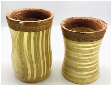
Charlie turned two birch plywood cups one glued up vertically, one horizontally. The tops are oak dyed.