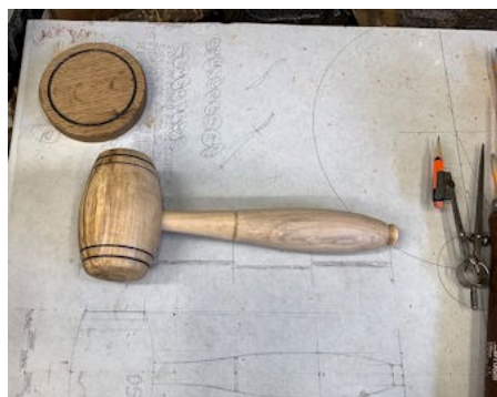
The gavel pictured next to its sound block.