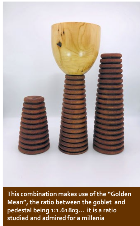
This combination makes use of the "Golden Mean", the ratio between the goblet and pedestal being 1:1.61803... it is a ratio studied and admired for a millenia