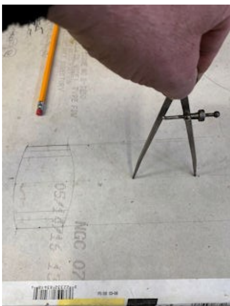
Pictured is a drawing Bob began with, showing the proportion of the handle to the barrel shaped head of the gavel