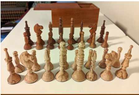
Pictured is a chess set turned by Lenny Langevin for his cousin. The pieces are spalted maple and tigerwood Concalvo Alves from Africa which as you can see is a mahogany color with dark streaks. . He added a penny to the bottom for weight to the larger pieces. For the pawns because the base was smaller he used a screw in the base. In the back is a box constructed from mahogany for storage when not in use