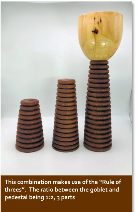
This combination makes use of the "Rule of threes". The ratio between the goblet and pedestal being 1:2, 3 parts

Charlie produced the three displayed images above , a turned a goblet with three different bases. It is a presentation of the various visual arts rules. The goblet itself is made of spalted maple. The rings were turned and assembled separately.