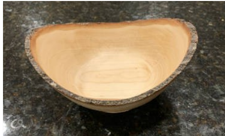
You're looking at a natural edge bowl with a graceful curve and foot turned by Glenn Siegmann from sugar maple.