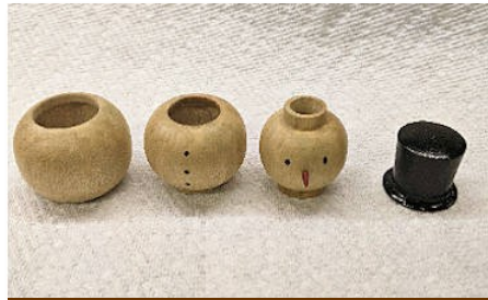
Here's the same snowman, shown unassembled in it's individual pieces