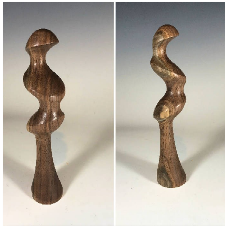
Pictured are two views of an off center turned female figure by Pablo and won by Peter Soltz.