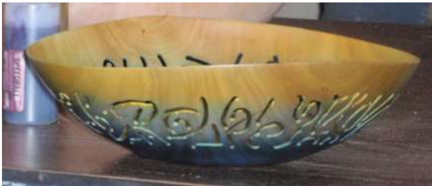
Nigel also uses the glue image in the wood as a pattern to pierce the bowl in a decorative way.