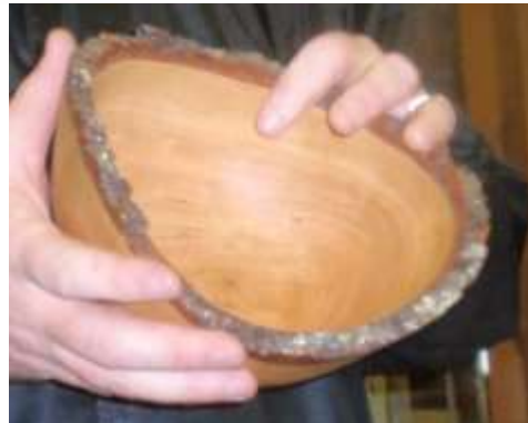
In the photo above Fred has a natural edge bowl from Black Cherry. He finished this one with friction polish.