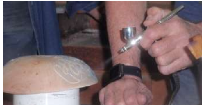
Here Nigel uses an airbrush to spray dye over the surface of the bowl after the glue has been applied.