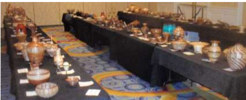
Exhibit area - a partial view