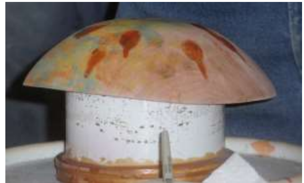
Another method of using color is to allow droplets of dye to randomly fall onto the bowl's surface as is shown here.