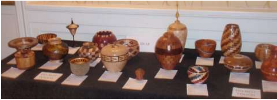
More exhibit items on display