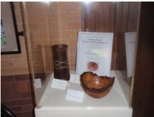
Main entrance display case