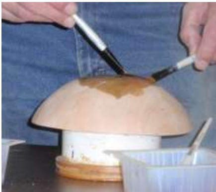
Nigel showed us this technique of using two brushes simultaneously to spread dye on the bowl.