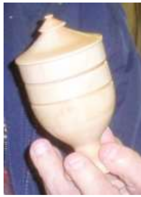
Sid is holding a spalted Ash box with a nice snap fit to it