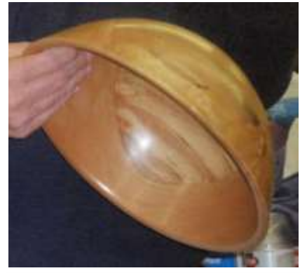
Kevin showed a third turned bowl of spalted Beech.