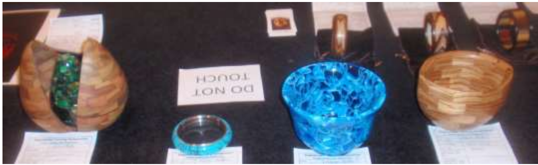
Four turnings by Wayne Miller on display at the symposium