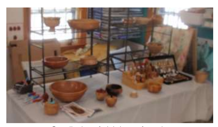
Our display of club items for sale.