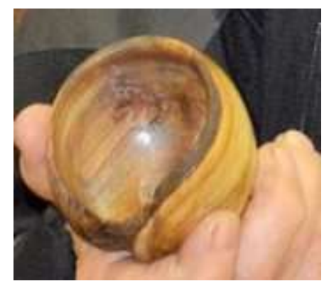
Ben holds a Bloodwood box with a Walnut lid; pictured here is a Tiger Maple box stained yellow. You have to twist the lid to open as it has a pin inserted in the lid; and finally a small Maple crotch bowl.