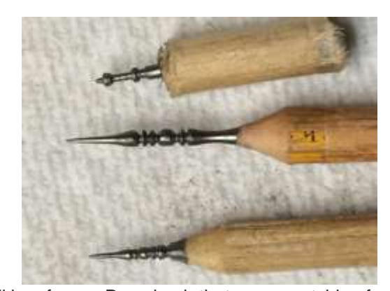
Lenny had a Maple 6 sided bowl with 5 wood bolts from the cut offs, a small box from a Rose bush that grows outside of the Wareham club meeting place, and 3 pencil tips one having a captive ring.