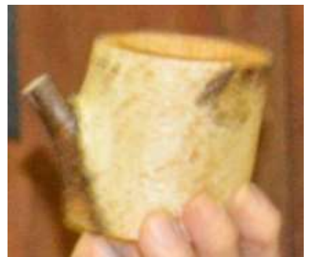
Ben Natale small Butternut scoop, box made from gluing 20 pieces of light wood formerly from the foot pedals of an organ. It has a Cherry lid with an Oak knob; and cup 2 1/2" in diameter of white Birch with an exposed branch on the side. Ben hollowed it out using a Forstner bit.