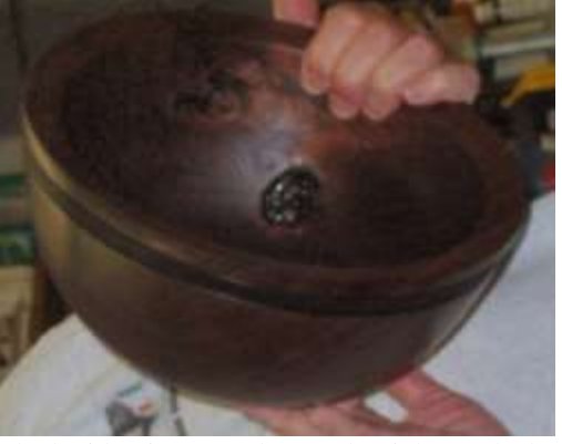
Two bowls from Paul O'Neil - on the left is a bowl with a textured band is finished with wipe on poly. On the right, a Black Walnut bowl [turned from Dooley wood] and also textured around the rim.