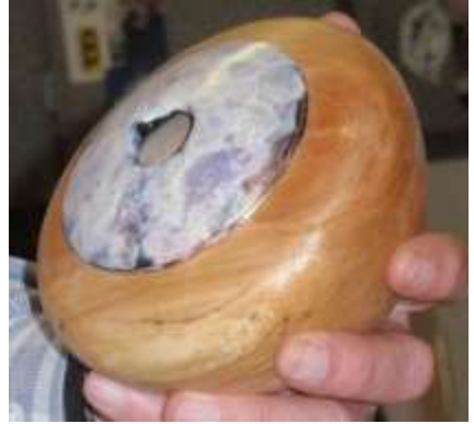
Steve holds a large bowl with a raised rim in which he used iridescent paint on the rim starting with black and using increasingly lighter colors as he went along. He wanted to turn it from dry wood.

It was commented that the shape outside under the rim was a little too straight and could have been curved in more.