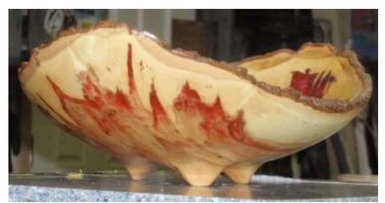
Three views of Ken Lindgren's box elder natural edge bowl. Ken burned outlines of the red color before using aniline dye to enhance and preserve the red color inside the bowl.