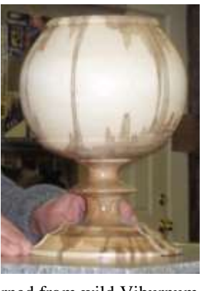
Lenny Langevin showed - a small box with a marble on top turned from wild Viburnum (also known as Arrowwood), a miniature compote of Ebony made from glued up corner pieces from Phil Arcouette's vase base with a Spalted Holly insert in the bottom, a Tiger Maple box, and finally a compote from Ambrosia Maple with a split base from wood found along the road.

Critque of the Ambrosia Maple compote involved suggestions that the base could be smaller in circumference, the split base could be converted into legs, the bottom of the base could be removed making it shorter and more.