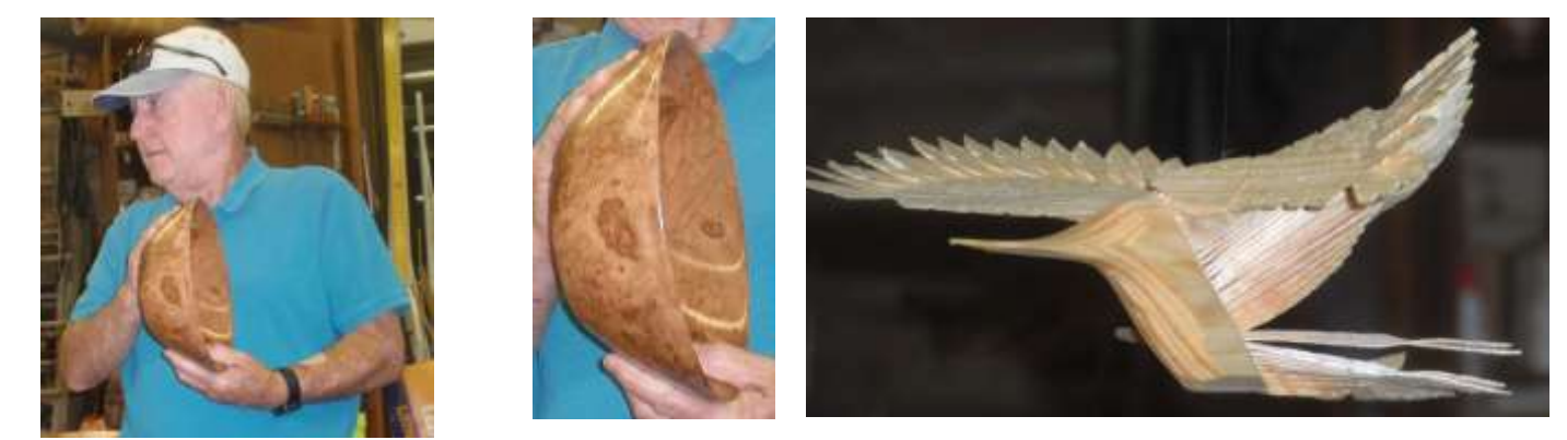
An old time member came by to show nice burl bowl that he finished using Elmer's glue and then sprayed with lacquer. It was suggested that he could smooth the surface with wet sanding with micromesh or using fine steel wool and buffing with a paper towel on the lathe. He also showed a pretty spectacular carving of a humming bird from a broom handle.