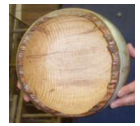
Nigel holds a Berkeley Maple natural edge bowl which has some dye added to the outside.