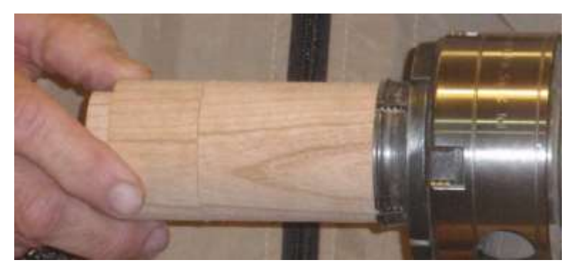
The box is mounted so that the bottom can be hollowed.