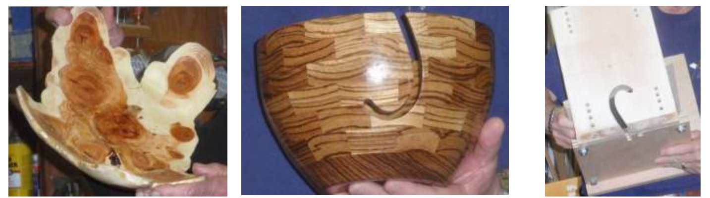
Wally is holding a natural edge turning of a piece of yew. It has a lacquer finish