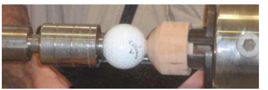
Steve uses a golf ball mounted on a live center on the tailstock to hold the lid onto the box