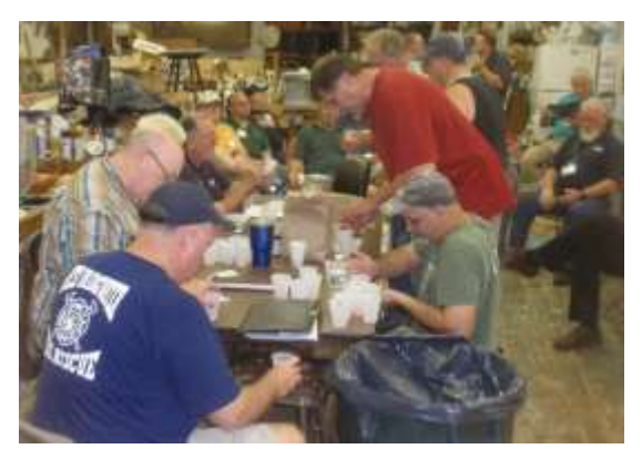
The beads in the cups get counted. We had 55 items and only needed 35 (plus three for a case display) so not everything was chosen.