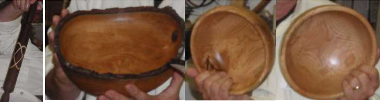
- a Walnut inlaid rolling pin w/Celtic knot from Joe Centrino

Two views, one of a Maple Leaf, and the other of a Dragonfly by Lenny Mandeville. He used clear Mylar with a sticky backing to trace the outline of the object which he then cut out. He transferred the image to the surface and traced it and colored it in after removing the Mylar. He then covered it back up to protect the surface while dyeing the remaining area. The third picture shows three pieces turned and finished from Bernie wood