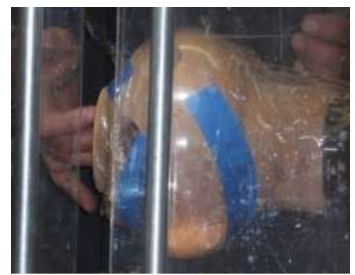
He uses cellophane wrap to keep his hollowform from drying out between turning sessions as is pictured here. Blue tape holds it in place

http://www.packardwoodworks.com/Merchant2/merchant.mvc?Screen=CTGY&Category Code=tools-ellsw-hollo