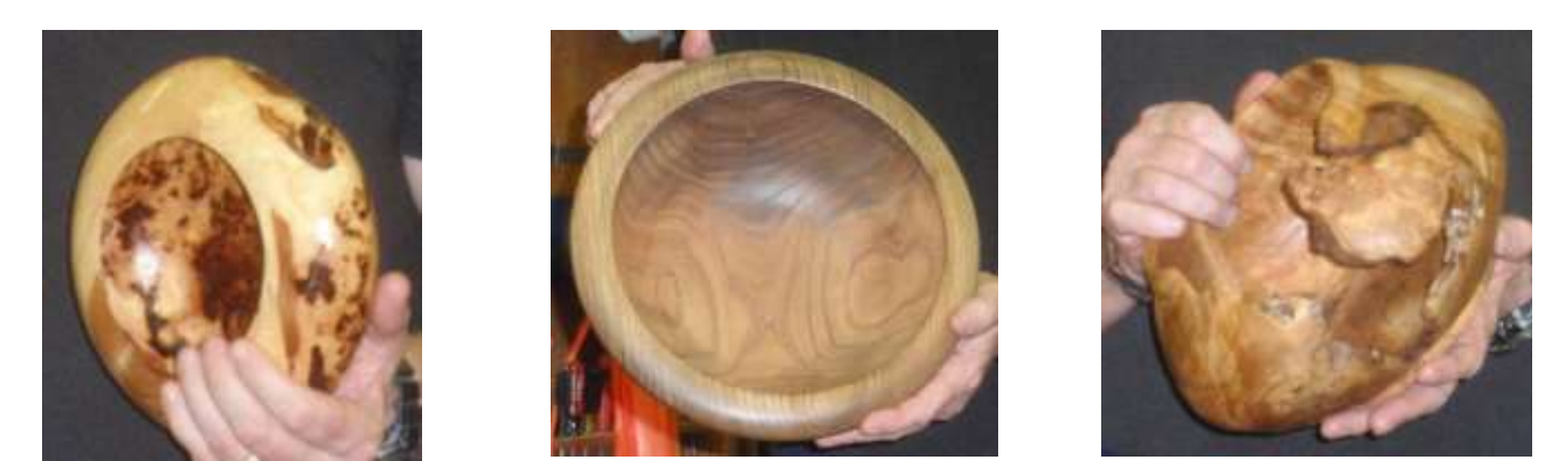
Kevin holds a natural edge Cherry burl bowl turned to 1/8th of an inch thick, an Ash bowl from Bernie wood, a Hickory burl bowl turned wet and finished with three coats of Tung oil.