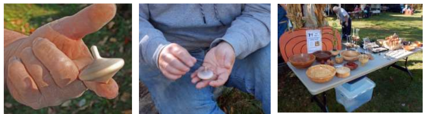
Spinning a top on a finger and in a hand

Another view of the items for sale on display