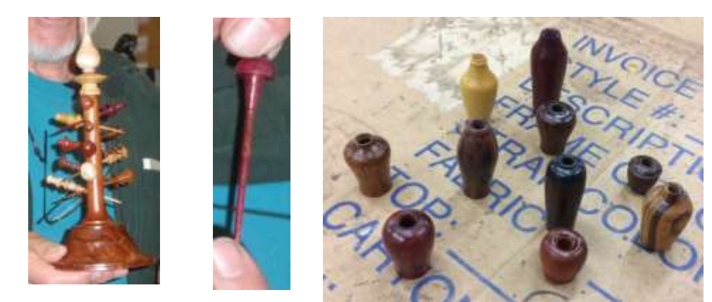
An interesting stand with wood pins turned by Lenny for a woman client he met at a demo in New Bedford to imitate her whalebone pins. He bought a selection of pen blank wood for the variety, next picture is a close up of one of Lenny's pins, followed by a picture of some very small Miniature ginger jars turned by Lenny Langevin from wood pen blanks.