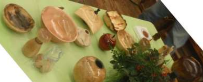
Two views of the Gift Grab items