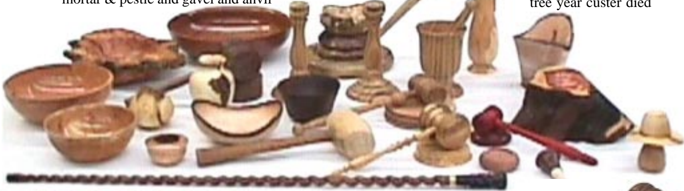
Frank Movitz's padauk gavel & cocobolo anvil with walnut stopper from walnut tree year custer died