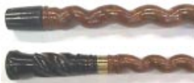
Jeff's walnut & ebony walking stick and spalted maple gavel and anvil