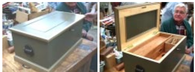
Fabricated while attending the Preservation Carpentry Program at North Bennet Street School