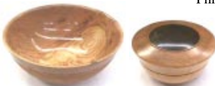
Philip's walnut vase with too thin bottom