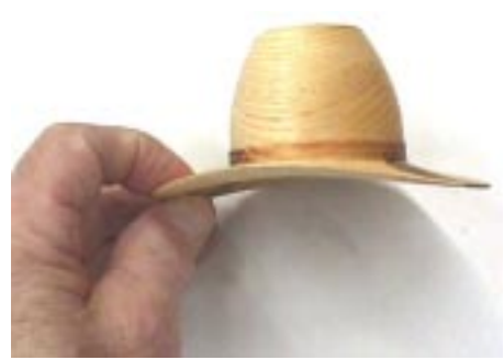
Richard shows curing hat off to admiring audience - closeup of forming fixture - Finished hat - note thin brim