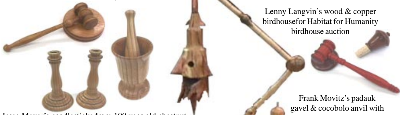
Jesse Meyer's candlesticks from 100 year old chestnut, mortar & pestle and gavel and anvil

Lenny Langvin's wood & copper birdhouse for Habitat for Humanity birdhouse auction