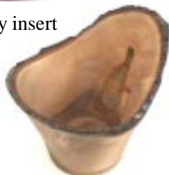
Hank's maple bowl and stem valve handle