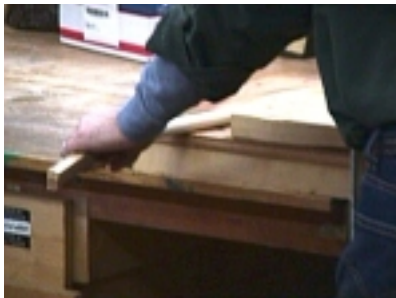
The final bend around the form