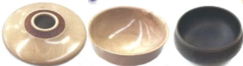
Jean's maple piece with stained ring, maple bowl, carved black bowl and unique box