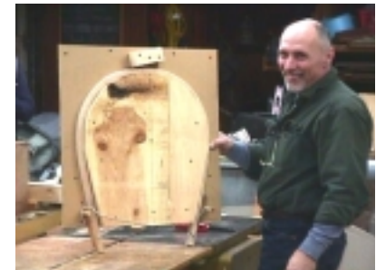
The bent stock on form