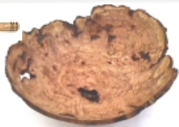
Wally's cherry burl bowl & "Profile of Woman"