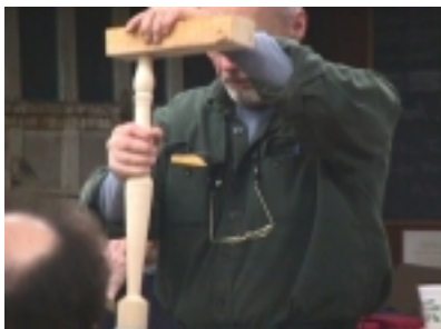
Turned legs with taper fit to seat