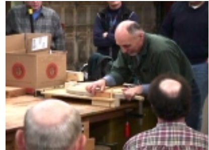
After 1/2 hour the wood is ready