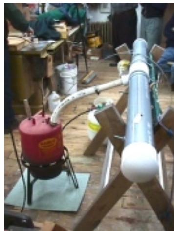
The propane steamer