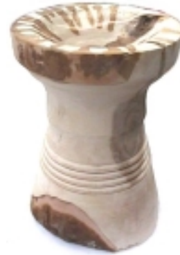
Ron Robertson’s leg for coffee table which will have four different legs