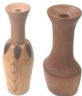
Dave Fountain's bud vases one off center turned