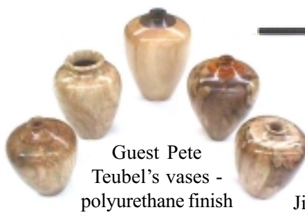
Guest Pete Teubel's vases - polyurethane finish