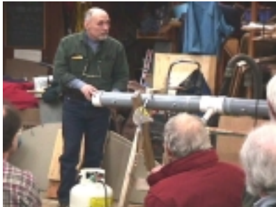
Green wood is placed in steamer