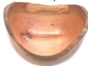
Nigel's segmented bowls and cherry bowl