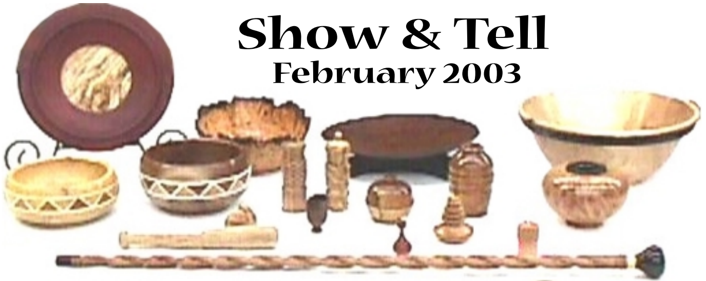
Bob Sutter used a 50-65 year old mahogany backing board for this plate