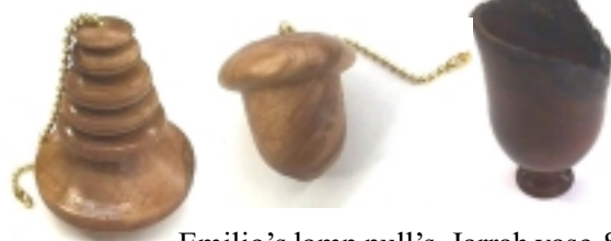
Emilio's lamp pull's, Jarrah vase & Cherry burl bowl