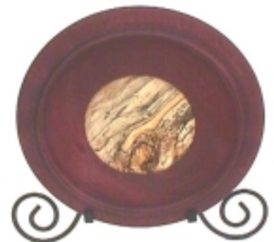
Ken Lindgren's clever laminated stock plate