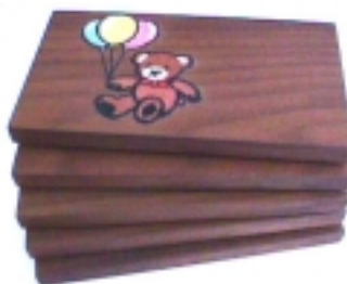
Mal's Embroiderwood™ samples from 1992 - the sewing is thru the wood!