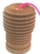
Mal's Gnome engine cylinder honey dipper became a lamp pull