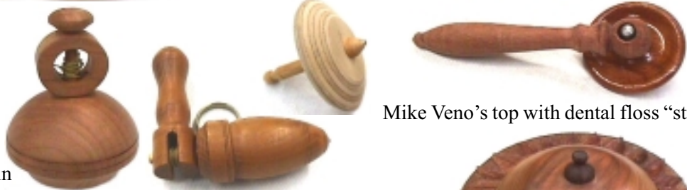
Mike Veno's top with dental floss "string"