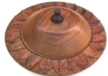
Bob Sutter's Walnut container with carved leaves & punch decoration