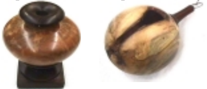
Emilio's "useless" wood pieces