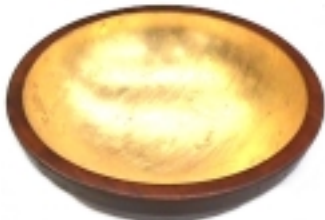
Lenny Langvin's collaborative of Angelo's cherry bowl with gold leaf interior & CNEW, MSSW, date carved along edge