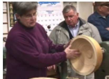
When 1" to 2" diameter is left to cut tap the edge of the core to break it loose. Prepare base for next coring.