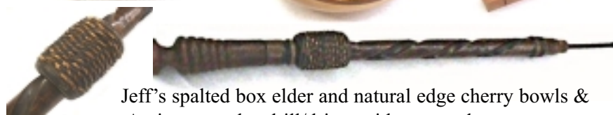
Jeff's spalted box elder and natural edge cherry bowls & Antique wooden drill/driver with wrapped cane actuator