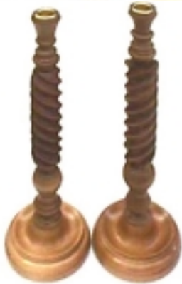
John Murpy's Maple Candlesticks with Walnut stain