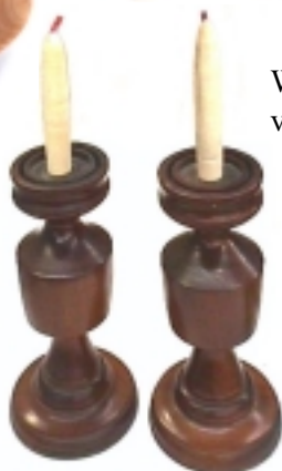
Ken Stevens's walnut candlesticks