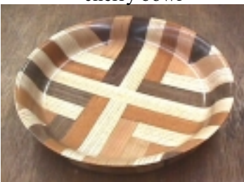
Frank Iafate's segmented plate