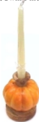
Emilio's real pumpkin candlestick