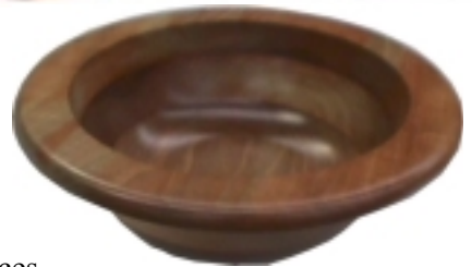
Bob Sutter's large 3 piece laminate walnut bowl