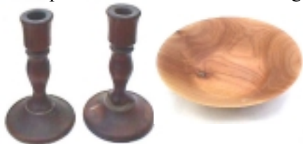
Hank's 1891 candlesticks and cherry bowl