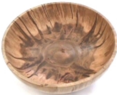
Hank's black heart maple bowl and square burl