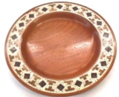
Ken Steven's plate with brick chips set in patching plaster