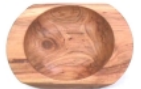
Sidney's burl from wood swap with square sides