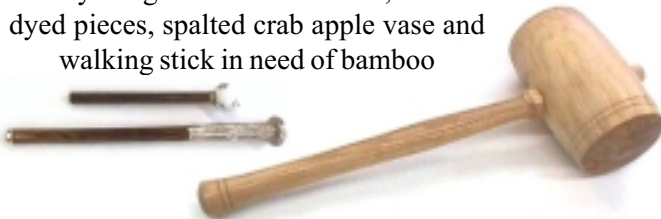
Rich Friberg's ash and maple mallet for setting oak pegs in timber framing