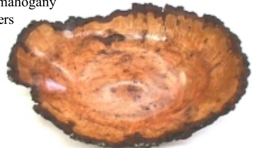
Wally's cherry and pine square pieces, mature crotch, and natural edge bowl