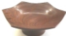
Mal's 8 side maple and 6 side walnut bowls