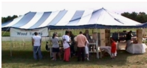
Woodturning tent at Farm City Festival, Prowse Farm, Canton, MA