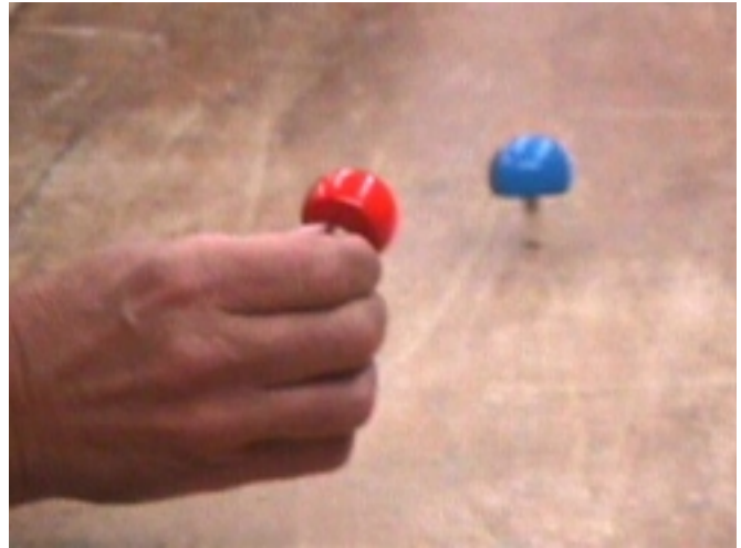
Mal brought in some Tippe Tops which lead to some fun during the refreshment break