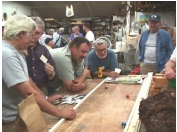
No, it's not a craps game, but members trying to understand the why and how of the Tippe Top's behavior.

* https://www.cds.caltech.edu/news/uploads/wiki/files/9/blochpresentation.pdf