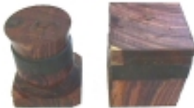
Peter's coffee scoops using two contrasting woods as seen on Ruth Niles web site