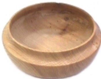
White Oak (Cracked then closed)