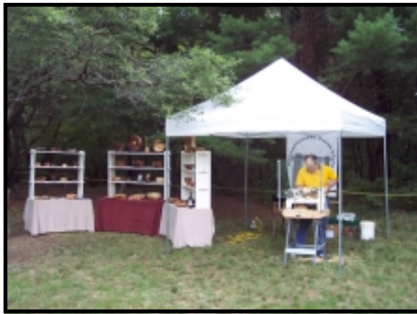
MSSW Booth and Display