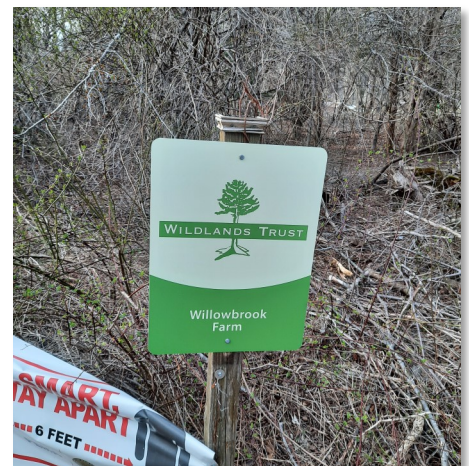
Pictured is the sign at the entrance to Willowbrook Farm, Wildlands trust in Pembroke located off of Rte 14 leading into Pembroke center. The park is on the right