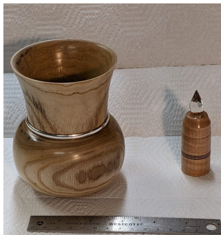
Pictured, is a SASSAFRAS wood in a woman's bracelet, turned by Lenny Langevin. On the right is a needle case also from sassafras both finished with friction polish.