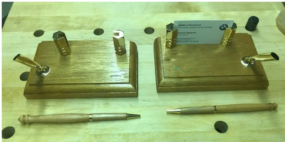
Pictured, are two pen stands and card holders made from CHERRY by Peter Soltz.