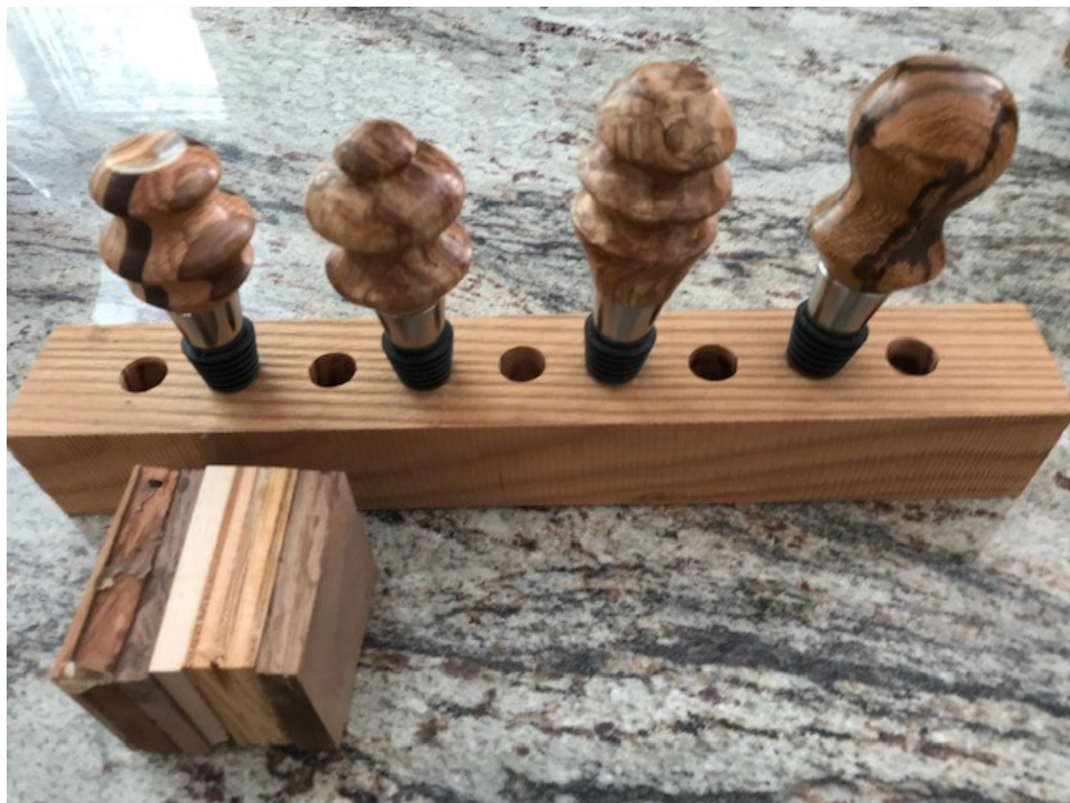
four more bottle stoppers, turned by Peter, with a piece of , laminated wood below them. Wood on the stoppers is laminate (left), maple burl (two in center) and marble wood on the right.