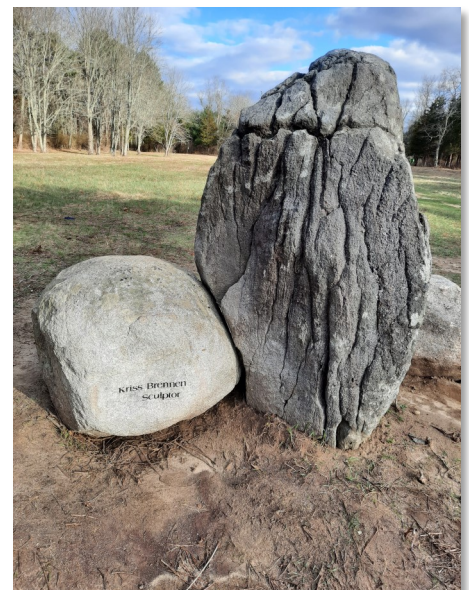
Pictured is the rear of the stone monument to Wally.