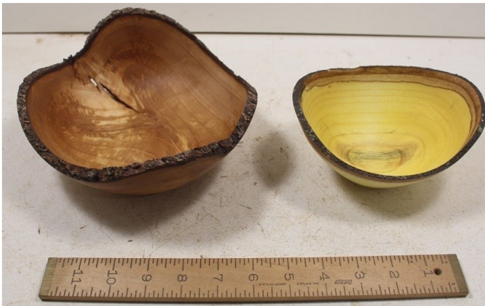
Pictured, above and below, are two natural edge bowls turned by Ed O'Riordan. The Species are PEAR on the left and YELLOW WOOD on the right.