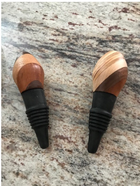
Pictured, are two spalted maple laminated wine bottle stoppers turned by Peter Soltz.