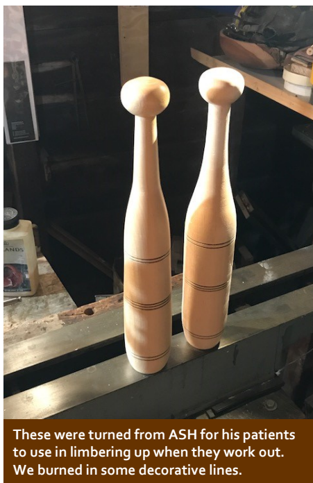
These were turned from ASH for his patients to use in limbering up when they work out. We burned in some decorative lines.