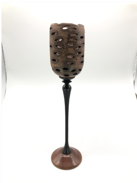
Pictured, is a goblet turned by Charlie McCarthy. It is turned from a bank zec pod showing holes where the seeds originated. It stands on a very thin ebony stem supported by a mahogany base.