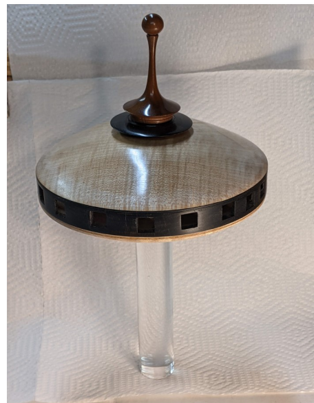
Lenny Langevin turned this "spaceship" like object with a clear acrylic stem (appropriated from a towel rack) with an ebony ring and finial.