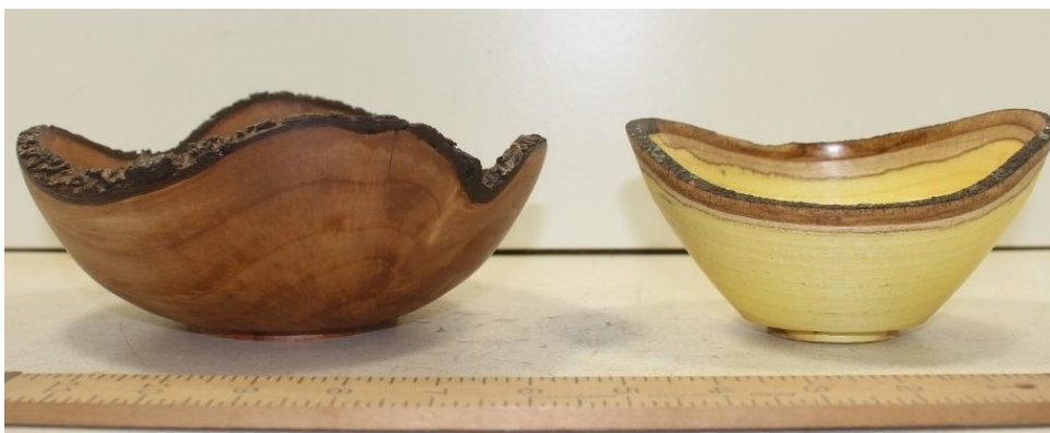
Pictured, is the side view of the bowls, turned by Ed O'Riordan. The Species are PEAR on the left and YELLOW WOOD on the right.