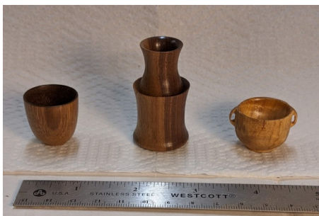
Lenny Langevin turned three small cups. If you look closely, you will see a tiny pair of handles on the one on the right (maple). The other two are mahogany.