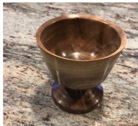
Pictured is a WALNUT crotch cup with a small foot turned by Peter Soltz.