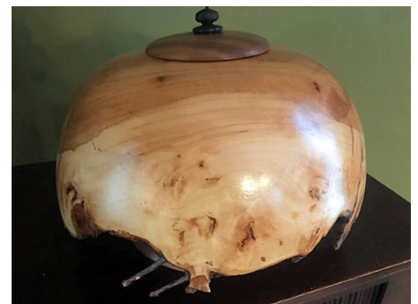
Pictured, is a piece of apple burl in the shape of a box. It is actually an upside down bowl with the natural edge on the bottom. In the photo you can see two thin branches sticking out which were part of the tree and left in for added effect. The "lid" is mahogany with an ebony finial. Hard to see but it sits on a pedestal. Kevin says it is a conversation piece -which it surely is.