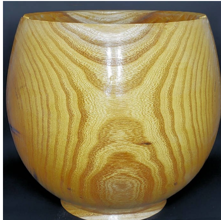
This deep bowl measures 8" x 8".