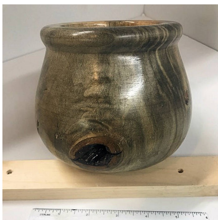
Pictured, is another view of Horace's 5" cup.