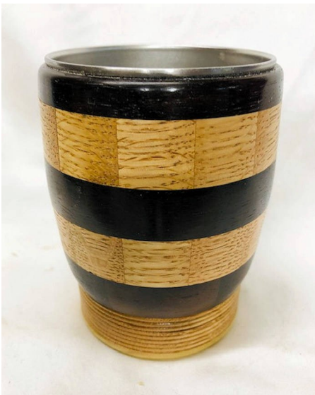
Charlie turned this segmented coffee mug using 12 segmented rings. The wood is maple and walnut. He added oak at the bottom with a tiny slip of poplar for the base. It has a stainless steel insert.