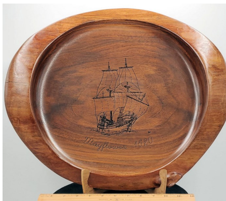
Joe turned this platter in walnut. He then created a pattern inside of the mayflower