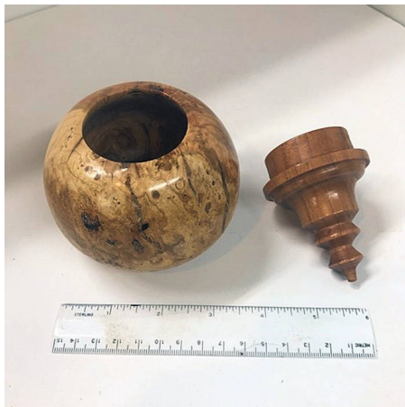
Pictured, is a nother view of Horace's box with the lid removed.