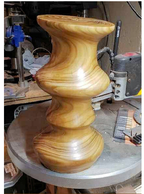
Pictured, another view of Fred's Vase