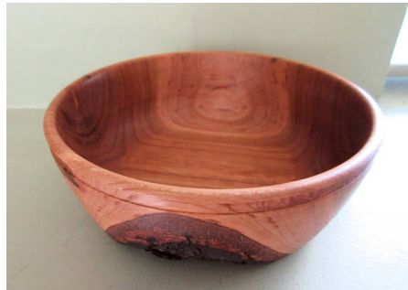
Pictured, is a piece of New Hampshire cherry in a shallow bowl 2" deep by 5" in diameter. The base has a partial bark occlusion. Bob finished it with walnut oil and used the Beale System to polish it.