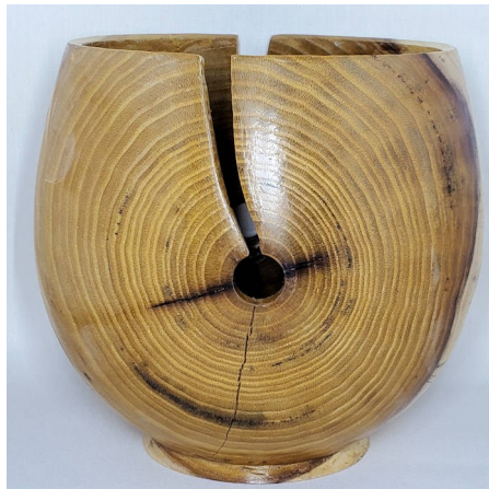
This was turned from a piece of mulberry with the pith drilled out after it split.