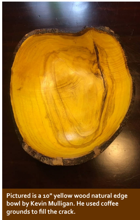
Pictured is a 10" yellow wood natural edge bowl by Kevin Mulligan. He used coffee grounds to fill the crack.