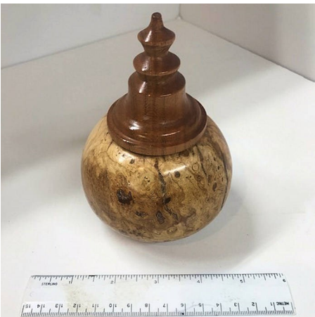
Pictured is a lidded box turned by Horace Lukens, it measures 4" x 6" high.