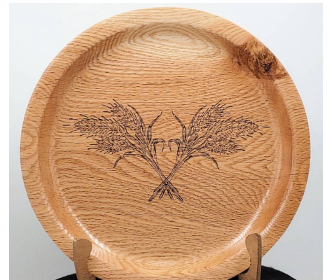
Pictured is an oak dish 11" in diameter showing laser burned sheaves of wheat. Joe also used his laser to sign the back of his