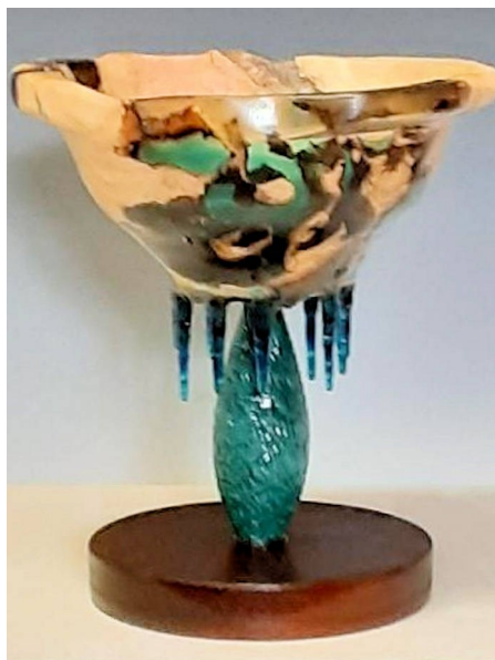
Ken Lindgren turned the top of this bowl part to a thickness of 5/8" using duct tape to cover the holes. He then filled the holes with resin and returned the outside. The wood is