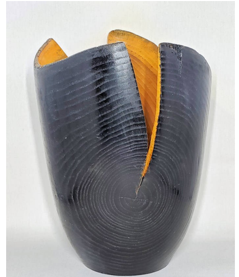
Pictured, is a large hollow form in which Andy first dyed the inside yellow and then dyed the outside black. It measures 9 1/2" by 7 1/2".