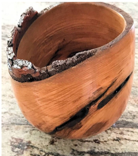
Pictured, is a natural edge cup measuring 5" by 6" which was turned from the log (Shown at Right) and then finished with shellac by Peter.