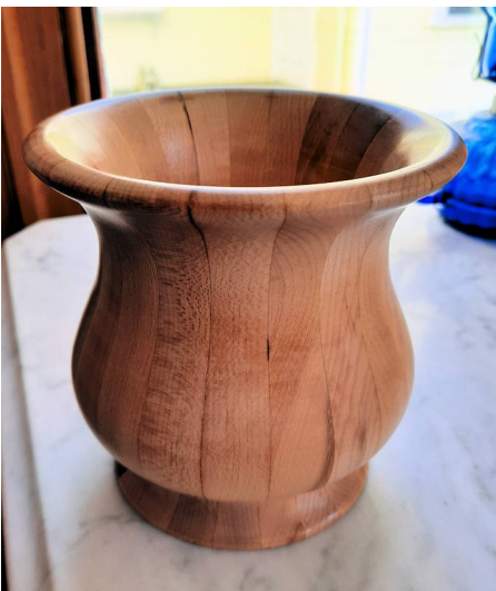
Pictured, is a segmented cup (about 5" high) with a flared edge by Jeff. The wood is maple and was originally cut and glued together by Wally Kemp as a cylinder to be turned later.