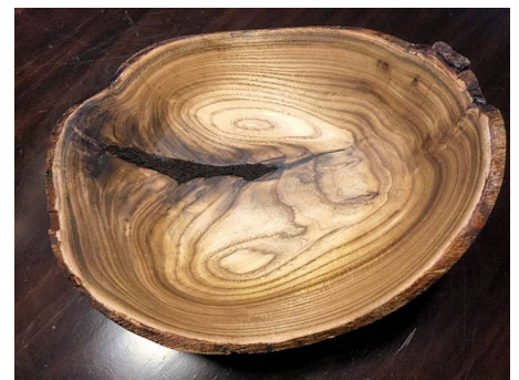
Here we see a natural edge Russian walnut bowl from Kevin. Mulligan. The wood is from the Arboretum. Bark occlusions are filled with coffee grounds.