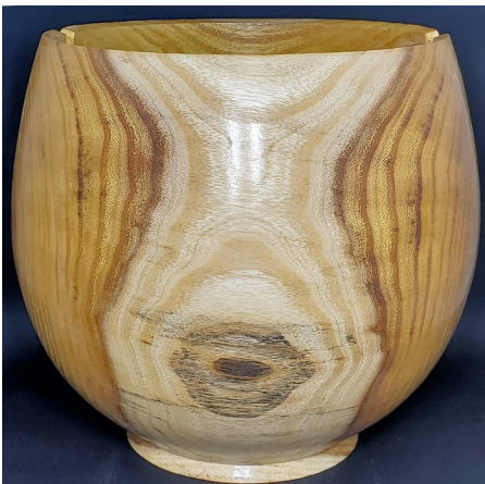
The crack caused some vibration while turning, so he wrapped a piece of tape around the piece while turning the inside.