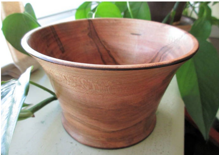
Pictured, is an ambrosia maple bowl from the lathe of Bob Courchesne. It measures 3" by 5". Bob used 3 coats of walnut oil for the finish