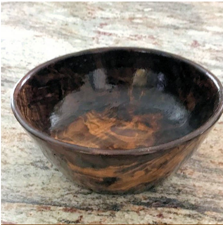
Pictured, is a nice bowl in claro walnut from the lathe of Peter Soltz. It measures 6" in diameter. It is finished with shellac and then 3-4 coats of Wipe-On Poly.