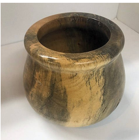
Horace also turned this small ( 5" wide) cup with a flared lip