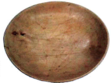
Wally's Walnut box and "Collision" bowl Note pen and ink lines