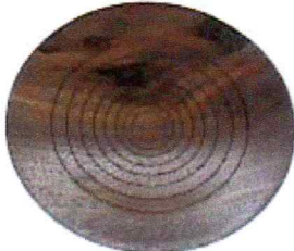
Thin Walnut pieces by Andy