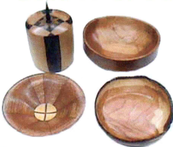
Ben's interesting segmented pieces and Cherry bowls