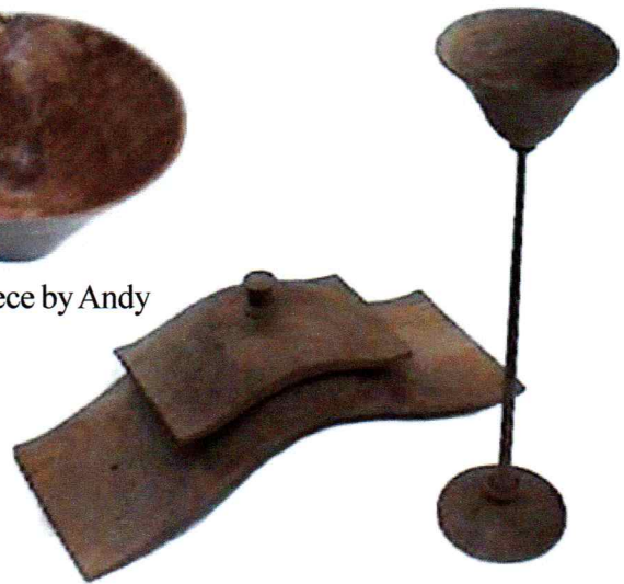
Bob Allen showed raffle pieces from Jimmy Clewes demo at Cape Cod Woodturners