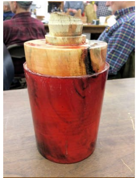
Resin blank—the resin was even with the height of the wood blank. After applied pressure and curing, much of the resin is absorbed into the wood.