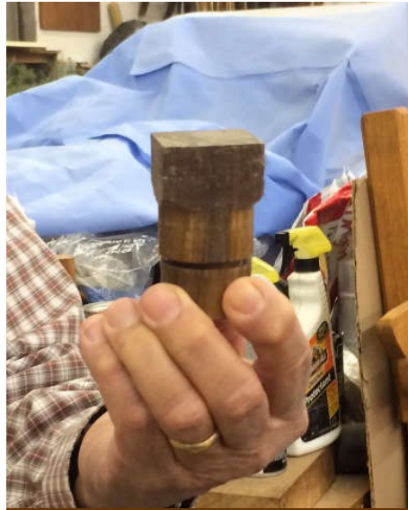
Closer look at Pablo's screw top box