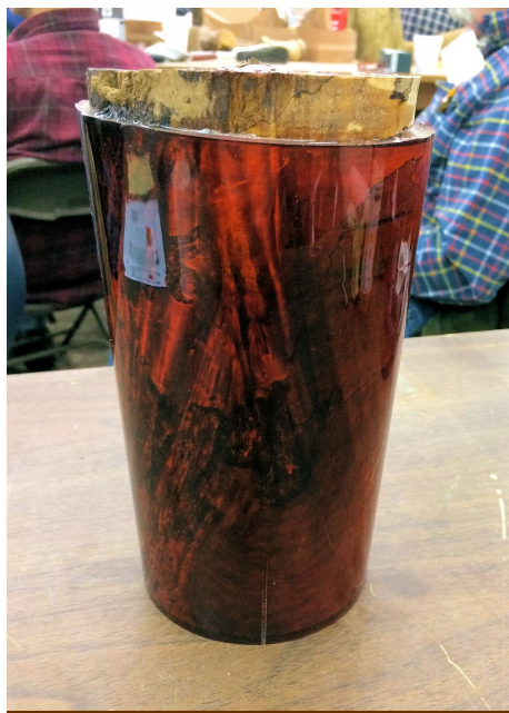
A resin blank, cured with a spunky piece of wood at its' core.

epoxy, remember that wood floats so it needs to be weighed down.