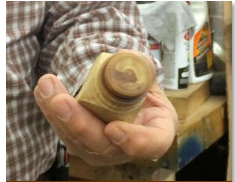
Closer look at Pablo's Box