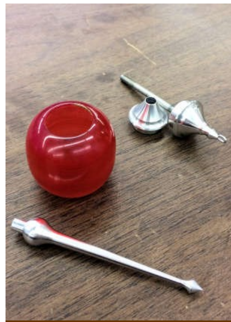
The Christmas ornament broken into its' components.