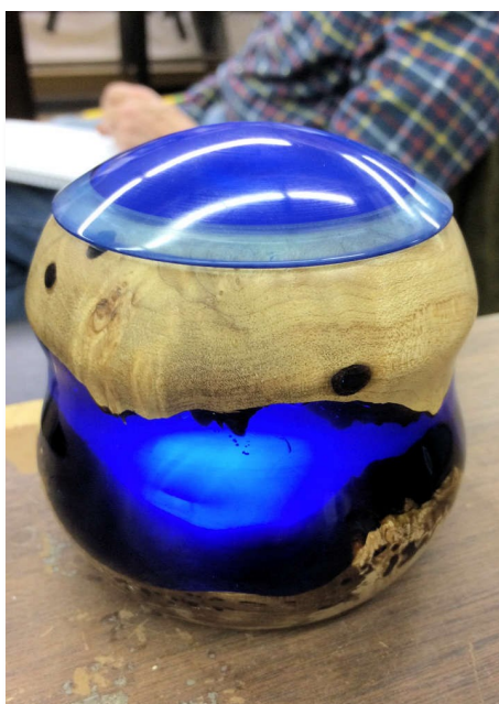
Steve's resin demo, a blue colored resin and maple burl lidded box.