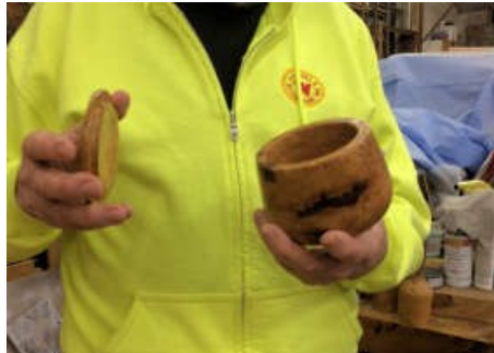
Paul also showed us a nice small pear bowl again finished with Tung oil.