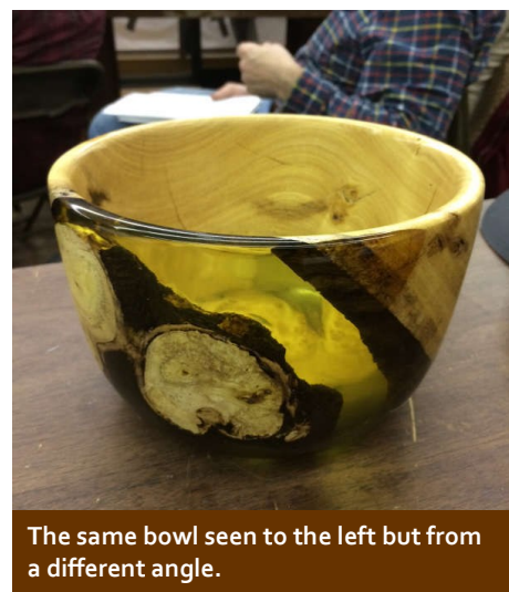
The same bowl seen to the left but from a different angle.