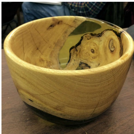
a larger bowl with yellow colored resin filling the specific parts where the wood is absent.