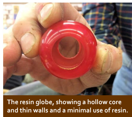
The resin globe, showing a hollow core and thin walls and a minimal use of resin.