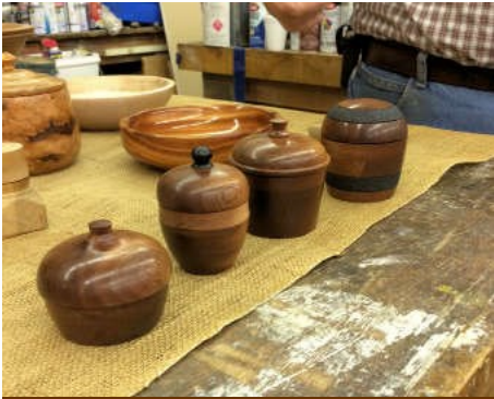
Four boxes turned by Pablo who then cut threads for the lids to screw onto the bases. He told us the trick "-is to rotate the top backwards until you hear a click then wind the lid on". He said the male threads are harder to make than the female threads. He said there are 20 threads per inch as a rule of thumb.