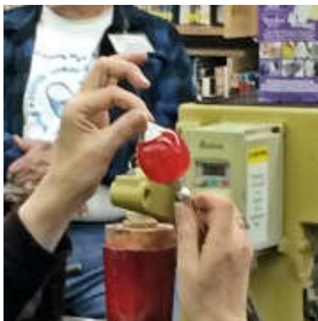
A Christmas ornament with a center resin globe

Lastly, never mix one kind or brand of epoxy with another. They are all different in their ingredients used and their respective mix ratios. You may experience a dangerous reaction.