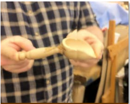
Tim holds a coffee scoop he turned from a piece of spalted maple.