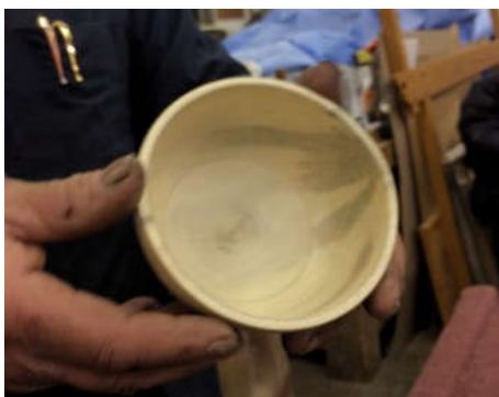
Bob showed us a second holly bowl, shown here