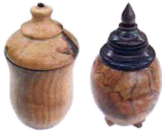
Mystery boxes from last month were turned by Hank!