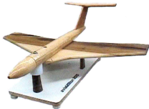
Don's desktop aircraft simulator for use in developing software for his full size simulator. Ash fuselage.