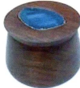
Ben's Walnut box - Agate insert