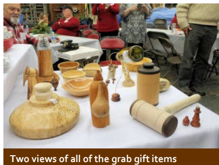
Two views of all of the grab gift items