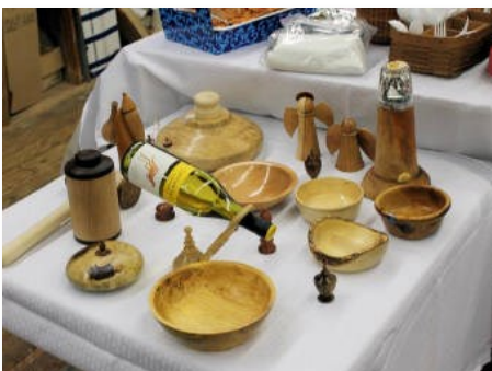
Two views of all of the grab gift items together