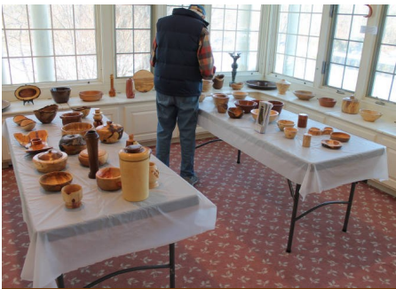
A view of some of our items on display and for sale.