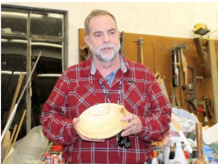
a recently turned elm bowl, his first piece and spalted wood. Nice effort.