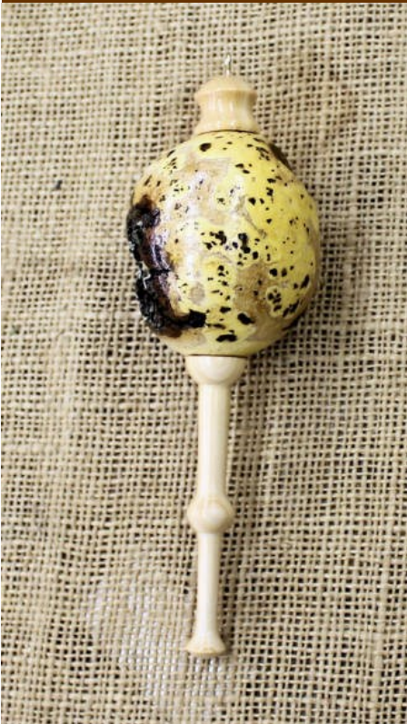
One last Christmas ornament.