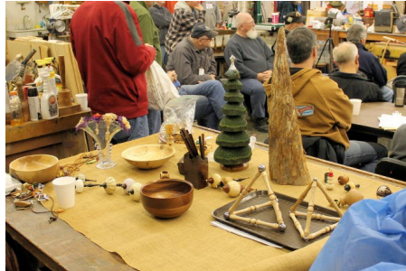
turned items on display for Show & Tell