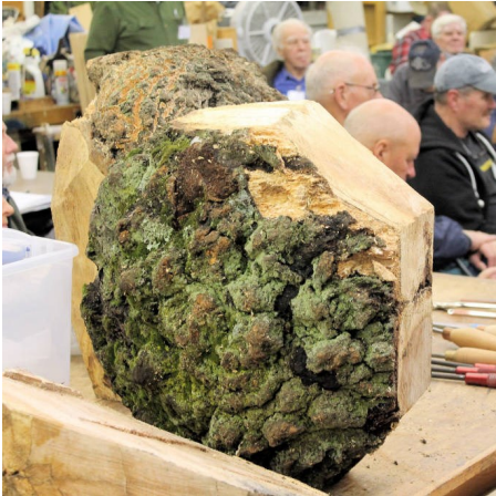
There were several pieces of red oak onion burl were available to members. A drawing was conducted.