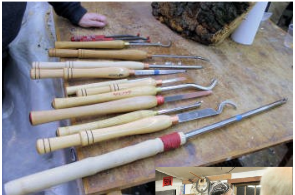
The tools Steve used in shaping and hollowing the hollowform.

Steve began by mounting a large piece of cedar on the lathe between centers and rounding it up. He then turned a tenon on the bottom and proceeded to shape the outside with a spindle gouge. Next he drilled out the center and hollowed it further with a large spindle gouge using the bottom wing to cut with. Steve then switched to a smaller carbon cutter which is less likely to get a catch to continue hollowing further. He used a swan neck tool cutting in and out from the top in. Starting at the top when you hollow leaves room for shavings as you go deeper. The longer the bar on the hollowing tool, the further you can go into the vase to hollow it. The large mass eliminates the chatter and there is no flex in the tool.