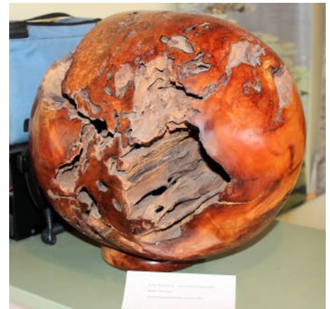
giant cherry burl sphere turned by Wally some years ago on permanent display