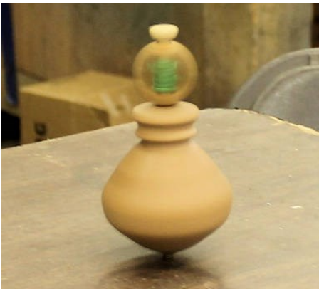
Joe was inspired from the previous meeting to turn a self winding top as shown in action here.