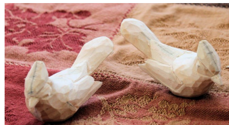
Closeup of Kevin's cardinal carvings