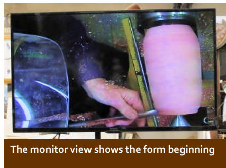
The monitor view shows the form beginning