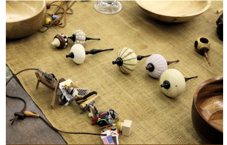
A closeup of several Christmas ornaments