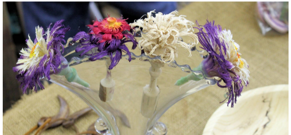
flowers turned and colored by Mike Veno