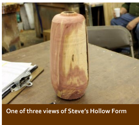
One of three views of Steve's Hollow Form