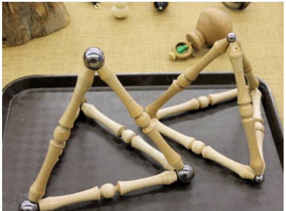
Charlie was inspired from an article in Woodturning Fundamentals on multiple axis turned objects using magnets in the ends with steel balls. One side is positive, the other is negative so you need to be aware of which is which when attaching the ends through magnification.