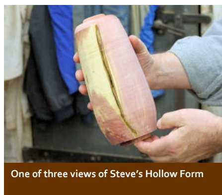
One of three views of Steve's Hollow Form