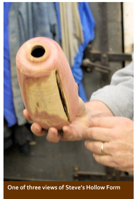
One of three views of Steve's Hollow Form