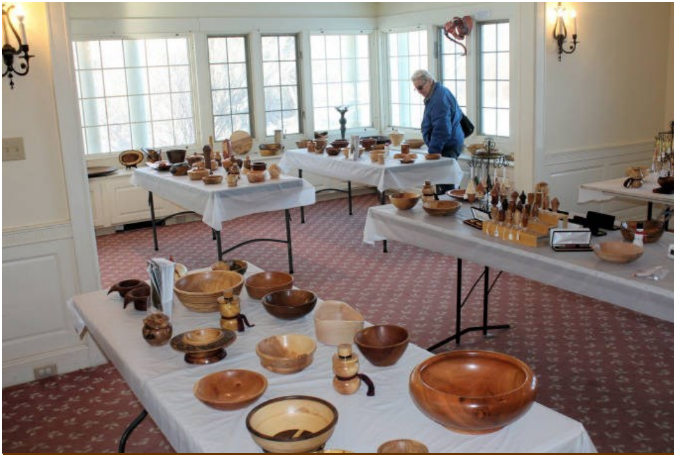
More of our items on display and for sale.