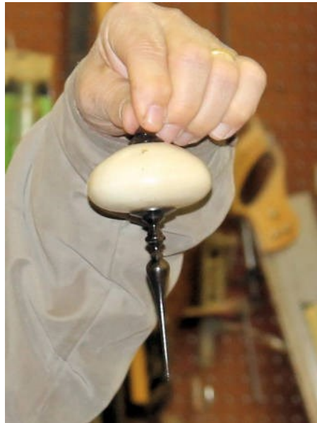
A closer view of Pablo's Christmas ornament, with the shell body.