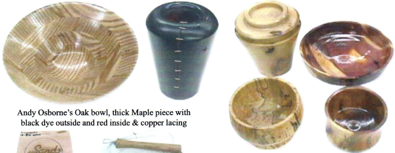
Andy Osborne's Oak bowl, thick Maple piece with black dye outside and red inside & copper lacing