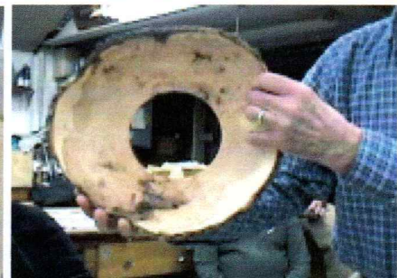
Wally's sandwich chuck and thin bowl with hole ready for insert. (Or is it a funnel?)