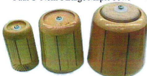
Ron's Nantucket Basket forms (molds) from 2x4's