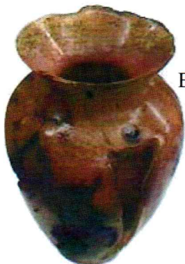
Nigel's Cherry Burl piece