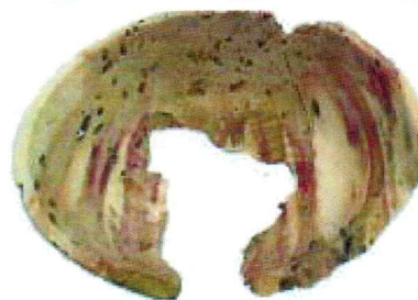
Ken's Box Elder "Full of holes" Box Elder bowl and Purpleheart tie