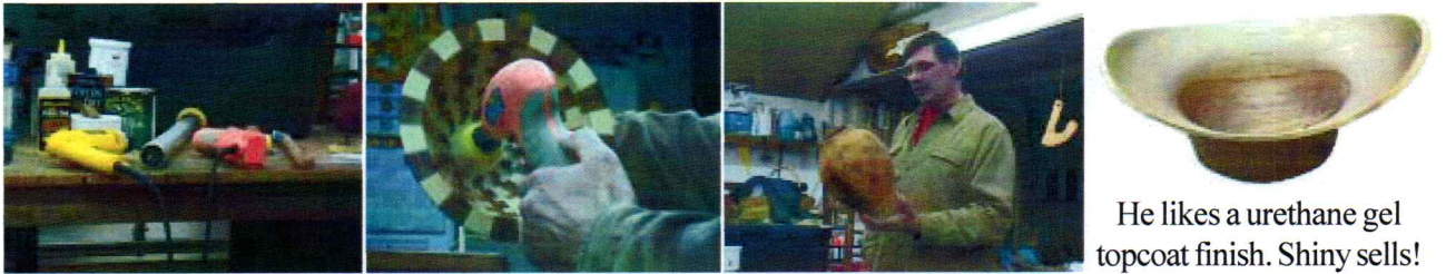
He likes a urethane gel topcoat finish. Shiny sells!