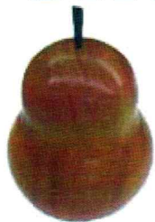
Jeff Keller's Osage Orange box