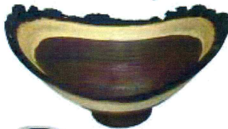
Bill Dooley's Black Walnut bowl