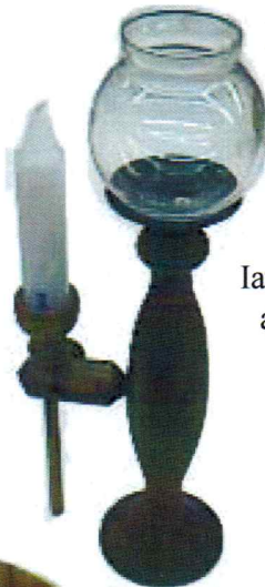
Ian Manley's Lacemaker's Lamp and segmented candle holders