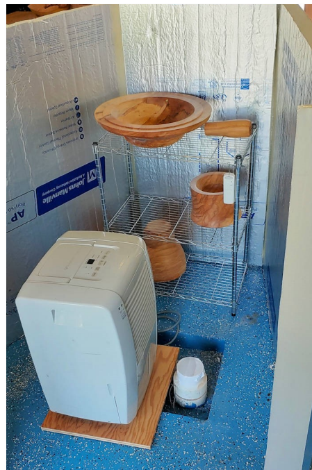
It includes a bowl with a 16" diameter in beech. Joe said they constructed a box around it from a foam core with a top that is relatively air tight. Joe added an indoor / outdoor humidity temperature meter.