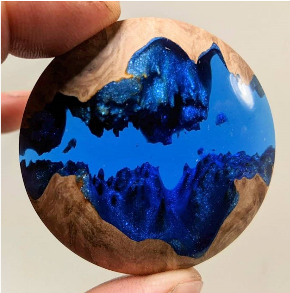
pictured is a piece of Australian burl with a blue resin insert from the lathe of Ed O'Riordan.