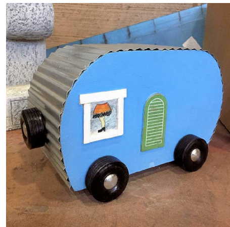
Here we see a bird house in the shape of a trailer with the aforementioned wheels attached