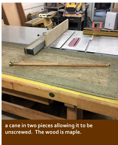
a cane in two pieces allowing it to be unscrewed. The wood is maple.