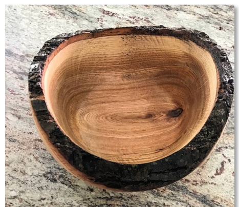
Pictured here is the top view. It is a small oak bowl with a pith running through it.