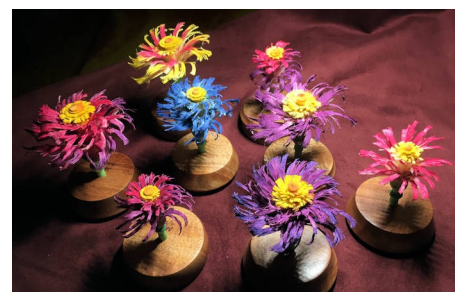
Pictured are Mike Veno's wood turned and dyed flowers which measure 2-4" in diameter on mahogany bases.