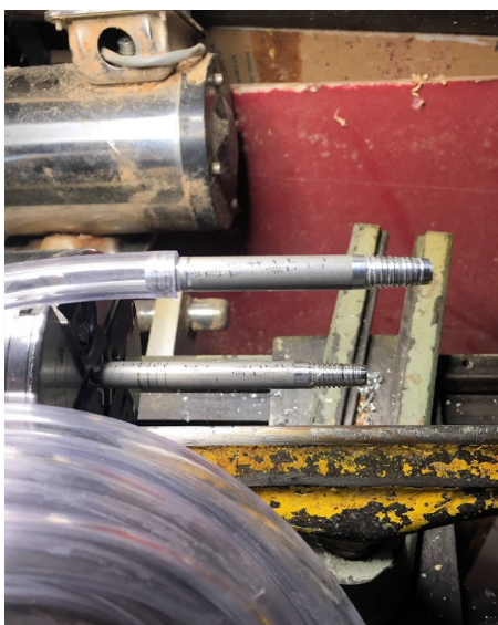
Pictured are aluminum threaded taps turned by Mike to allow tree sap to drain to make maple syrup.