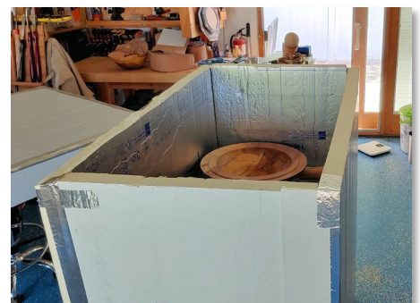
"Now it is 86 degrees inside. I want to see how much water is drawn out of it", he