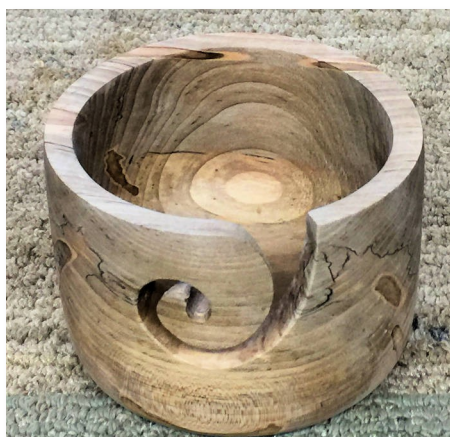
an earlier yarn bowl in ambrosia maple. Vince marked out the "J" on the outside and then used a coping saw to cut it out.