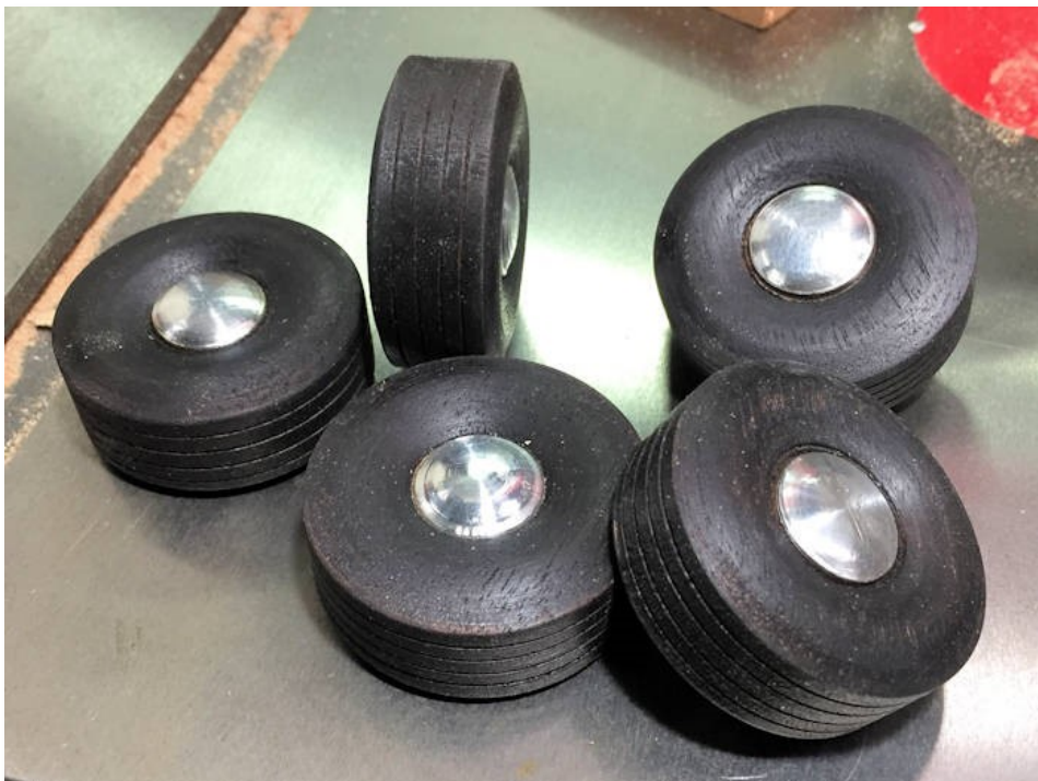
Pictured are four wheels set in mahogany turnings by Michael Veno.