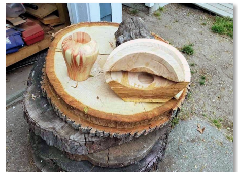
The piece to the right has a separated bowl which had a crack that Fred had filled with glue and coffee grounds before it fell apart. Next to it is the box elder vase. Fred said "It was a bad day for woodturning."