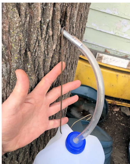
Mike told us, "Once the tree measures over 12" in diameter, you can tap it."