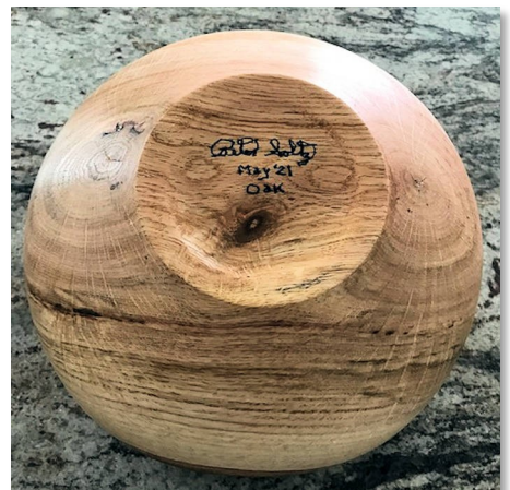
Pictured here and below is a natural edge bowl turned by Peter Soltz.