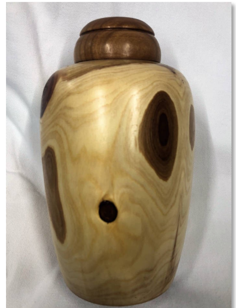
Here we see the completed hollow form with a screw-in insert and top.