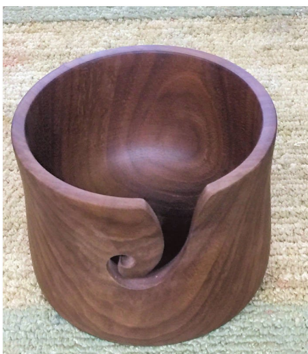
a yarn bowl turned by Vince Kennedy measuring 6 1/2" by 6 1/2" in walnut