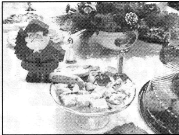
Deserts disappeared as Santa watches