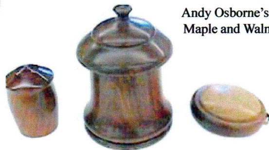
Ian Manley's Rosewood and Mahogany boxes and transformed Tape measure