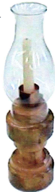
Don Diedrich's lamp