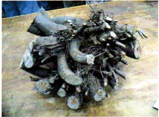
New Turner Wood Swap Challenge

It was reported that Downs and Reader Hardwood Co., Stoughton, MA has low cost Purpleheart available.