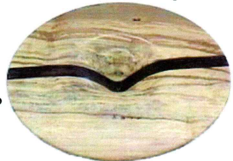
Andy Osborne's Spalted Maple and Walnut plate