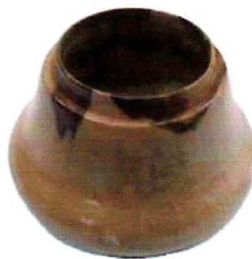
Ken added tear drop to last month's piece