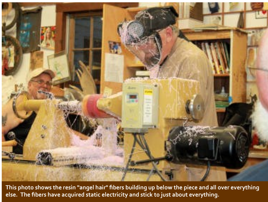
This photo shows the resin "angel hair" fibers building up below the piece and all over everything else. The fibers have acquired static electricity and stick to just about everything.