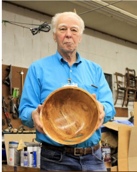
Full face view of Ken's bowl