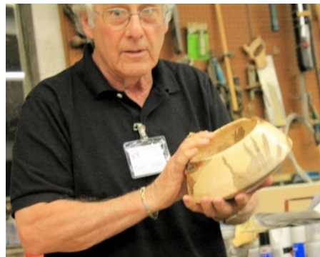
Another view of Peter's Ambrosia Maple piece.