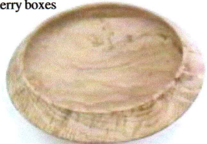
Nigel's natural edge Elm bowls turned green and White Oak burl bowl