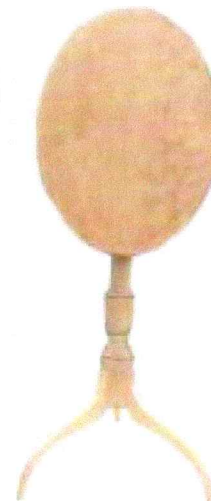
Jae Ewart's Cherry tilt top table built at NBSS