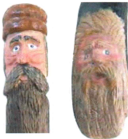
Hank's carvings on two canes he made

http://www.taunton.com/finewoodworking/Workshop/WorkshopArticle.aspx?id=28821