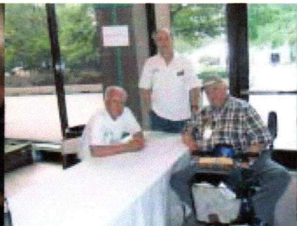
Happy campers at the registration table (in focus)