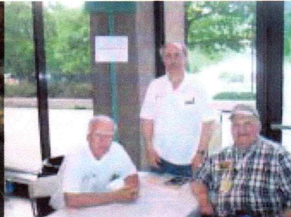
Happy campers at the registration table (slightly out of focus)