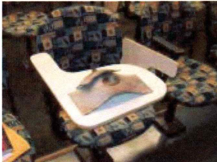
Jimmy's completed Oriental box turned at 25-2600 rpm.