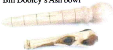
Ben's dibble and weed pot