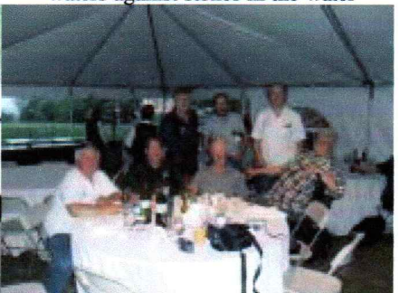
MSSW Saturday night banquet attendees still smiling