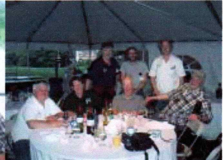
Saturday night banquet attendees