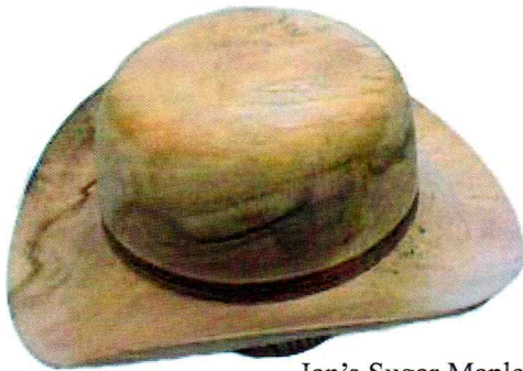
Ian's Sugar Maple hat