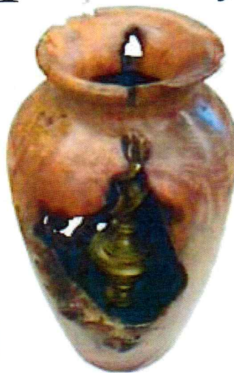
Wally's Cherry Burl vase with gold finial inside