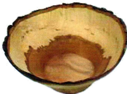
Nigel's Sugar Maple and Box Elder pieces