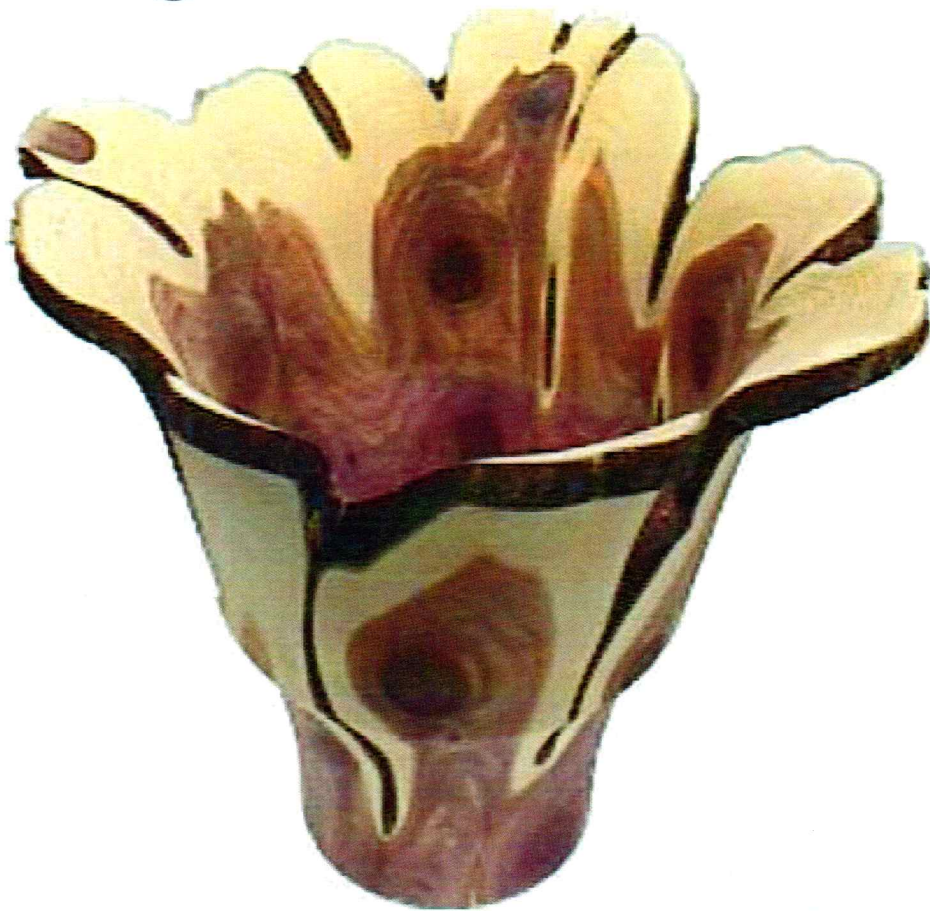
Wally Kemp's Juniper Flared vase