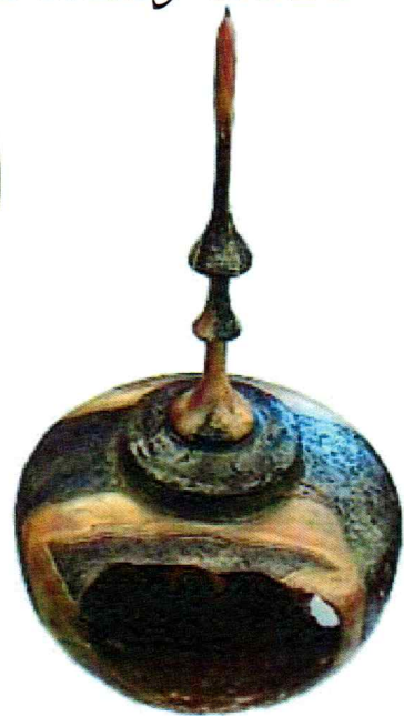
Ken's Box Elder piece