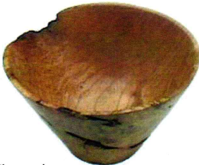
Tim Ayer's Cherry pieces