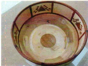
Bill George -The top trim and base are walnut. The basic wood is poplar. The design is cherry and maple. The finish is four coats of tung oil and the Beal system.