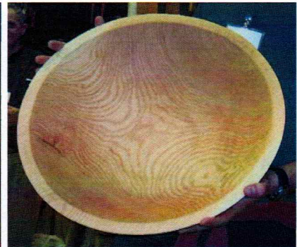
Tim Ayers sugar Maple bowl