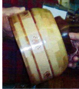
Bill George - segmented bowl of Mahogany & Poplar & Walnut carved base