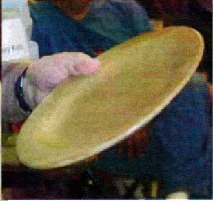
Sydney Katz's - Sassafras plate