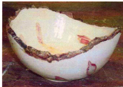
Wally Kemp - Box Elder natural edge bowl, used a water base poly finish to keep the color white, applied with an airbrush in three thin coats.