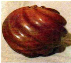
Bob Trucchi also showed a Walnut hollowform whose outer surface was carved with eight twisted swirls. He used a lacquer finish on both the hollowform and the Lignum Vitae box.