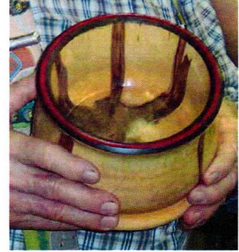
Ben Natale – end grain Ambrosia Maple bowl w/burnt edge and color from a felt tip.