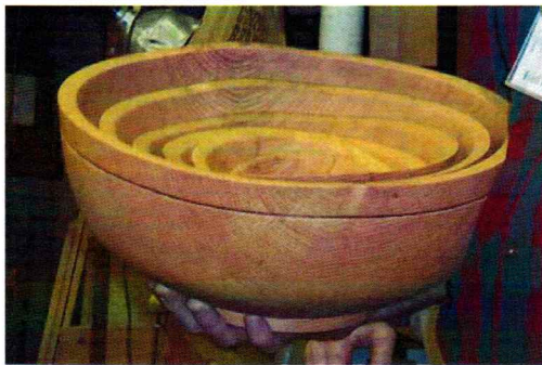
Fred Ayers nest of Red Oak bowls turned and cored with a One Way coring system.