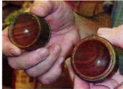
Bob Trucchi – threaded Lignum Vitae box The outer wood oxidized green after turning from the original brown color.