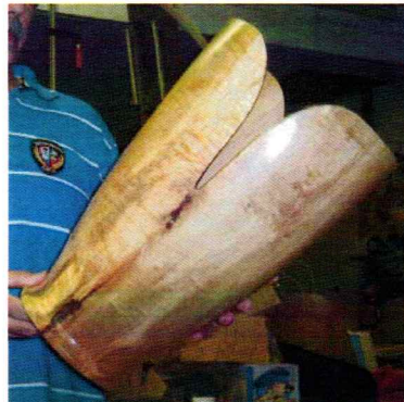
Nigel Howe – Sugar Maple vase