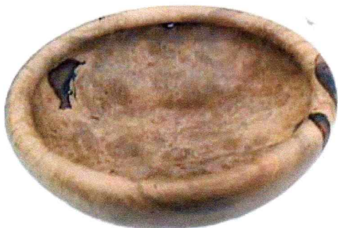
Nigel's large Maple bowl with turned in edge