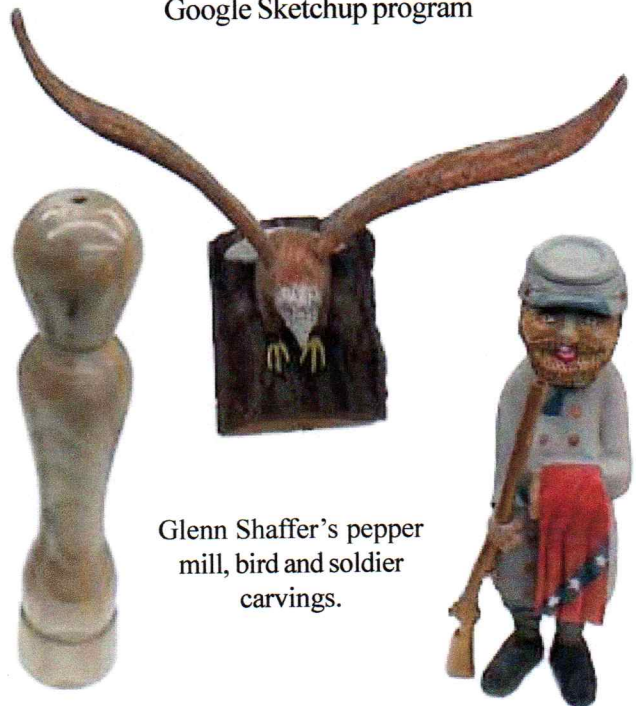
Glenn Shaffer's pepper mill, bird and soldier carvings.