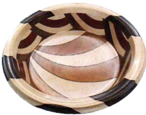
Bob Flood's large segmented pieces