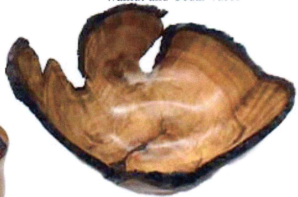
Wally's Natural edge Maple bowl