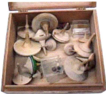
Jeff's bottle stoppers ready for sale at Audubon Exhibit