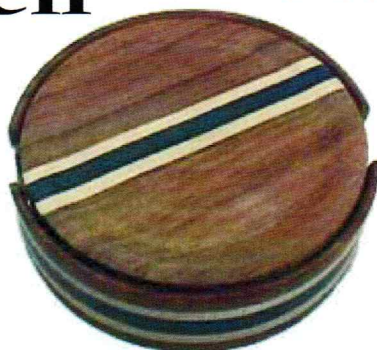
Ian's Segmented Coaster Set