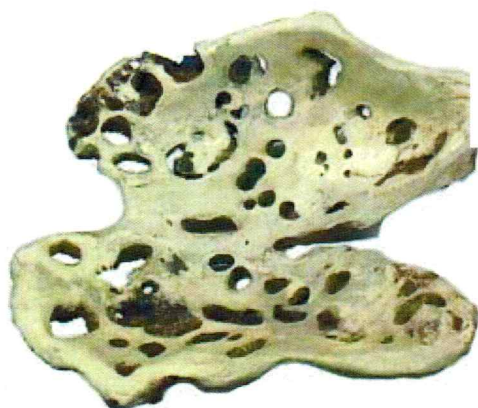
Ken's Angel Wings - wood from AAW Symposium