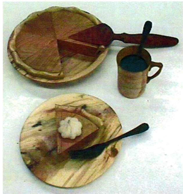
Bob Trucchi's Pumpkin Pie and serving - Mmm good!