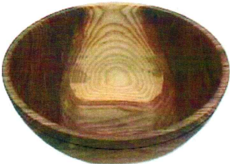
_____ 's_ bowl