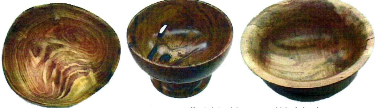
Jeff's Oak Burl Compote and Maple bowl