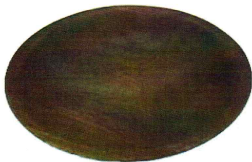
Paul's Walnut and Cherry bowls