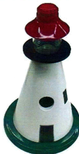
Ben's Light House for Birds, Burl weed pot & Spalted Maple small bowl