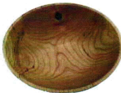
Tim Ayer's four bowls