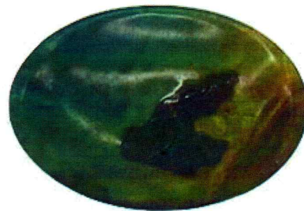
Ken's 2 Dyed Maple Burl pieces