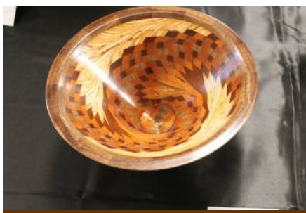
Some of the more diverse objects on display