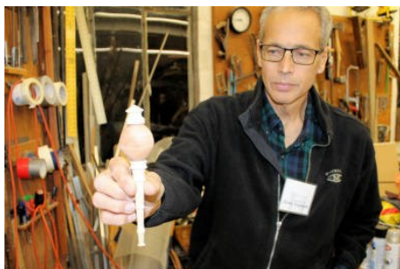
Here we see the finished ornament.

tree ornament. It was turned, dyed and sprayed with lacquer. You can add sprinkles to them for an added effect as well.