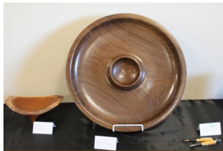
large walnut platter with dip insert turned by Joe Centorino.