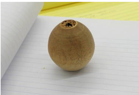
Showing the completed center.

tenon on one end of the middle part, then mounted it in the chuck. he drilled a 5/8" hole in one end for the bottom and drilled a 1/4" hole in the top. The 5/8" hole was most all the way through to help hollow out the inside using a Hunter tool or a hook tool. Next, shape the outside into an oval, or round.