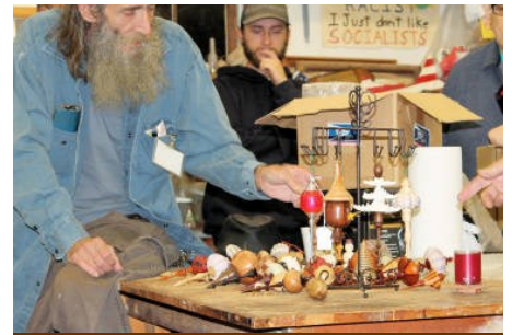
A bird's eye view of various ornaments