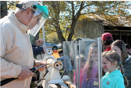
Joe turned a lot of tops for some wide eyed youngsters