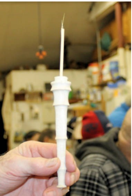
Here is the finished stem

Mount the stem between centers, round it up and undercut the top because it is going to be mounted on a round sur-