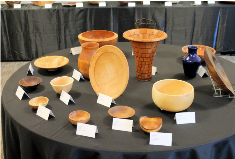
table with assorted turnings