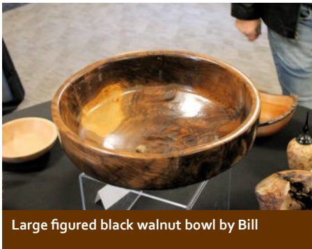
Large figured black walnut bowl by Bill