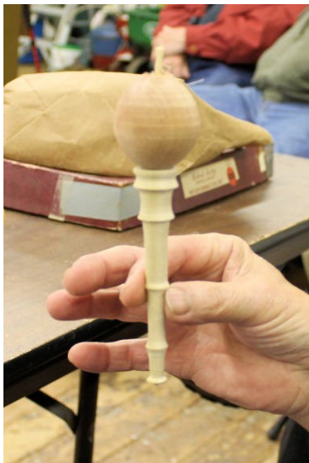
Here we see the finished ornament.