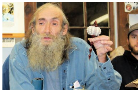
Here we see a shell ornament

You should use dry wood to hollow out for the center of your ornaments. Ian said that you can go online and type in "Turned Wooden Ornaments" and find a large selection of examples. He also mentioned that he uses a #2 fishhook for the eye part of the ornament.