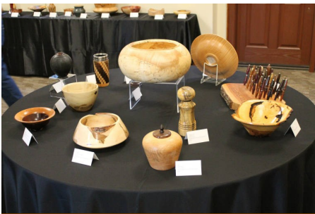
Miscellaneous items on display