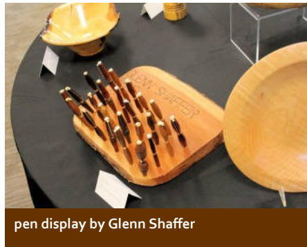
pen display by Glenn Shaffer