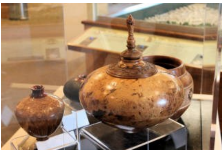
close up of a piece showing a carved collar