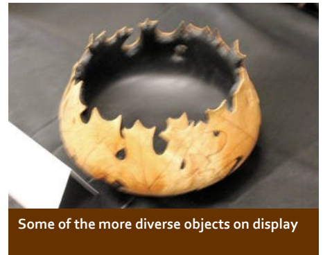
Some of the more diverse objects on display