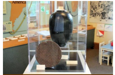
Interesting platter and a hollowform vessel