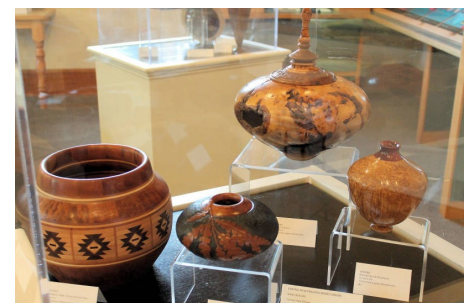
top and center turned items by master turner