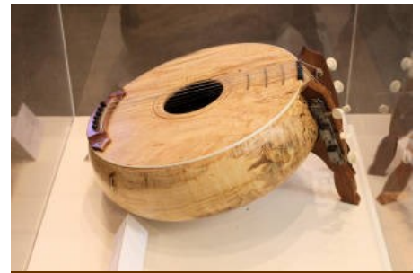
Lenny Langevin's musical instrument