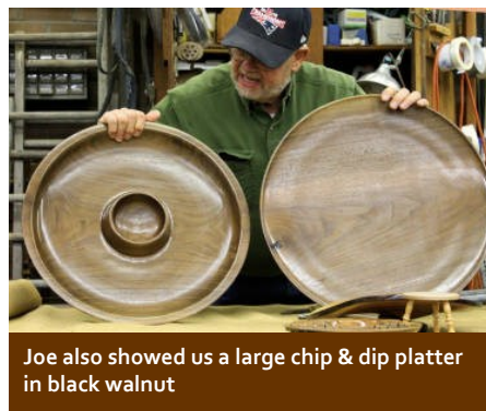
Joe also showed us a large chip & dip platter in black walnut