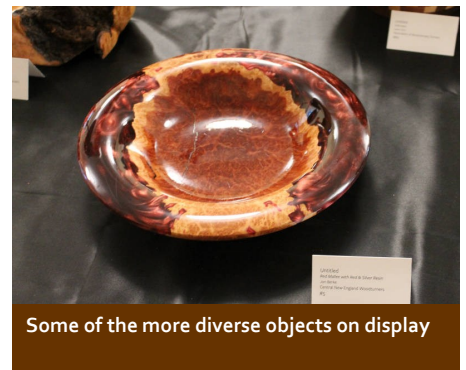
Some of the more diverse objects on display