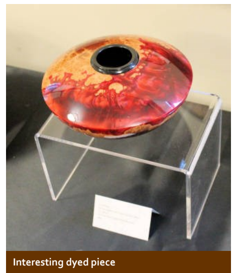
Interesting dyed piece