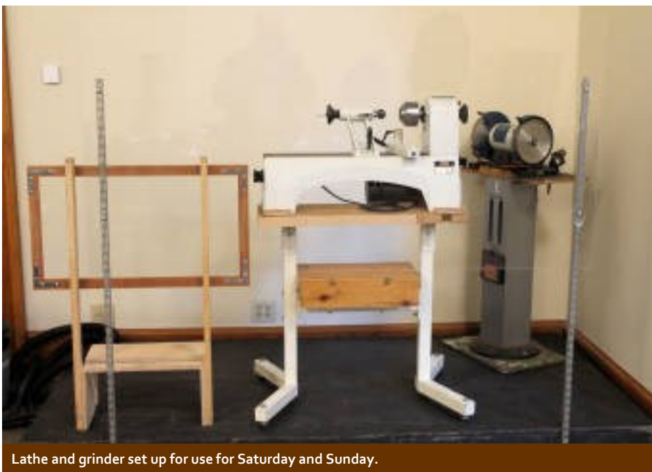
Lathe and grinder set up for use for Saturday and Sunday.