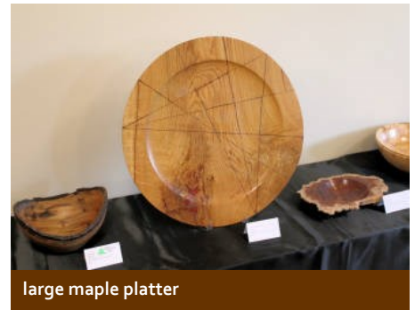
large maple platter