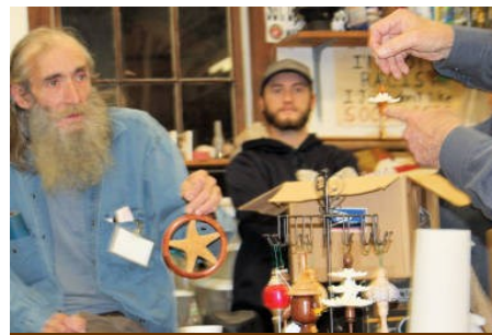
Here is a star in a circle ornament.