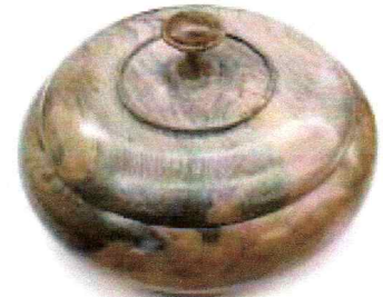
Sid's spalted Maple box