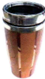
Ian added strips from scrap to Mike's cup kit.