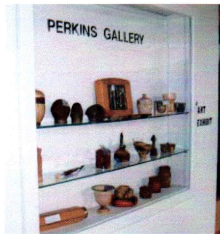
Small woodturnings on display at Perkins Gallery

Hand's On at Hanks was set for Saturday, September 13th.