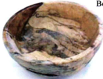
Hank's spalted Maple bowl