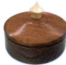
Guest Glenn Shaffer's first turning!