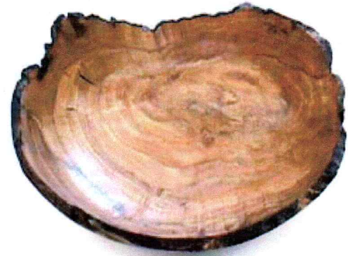
Wally's large bowl from Duxbury wood