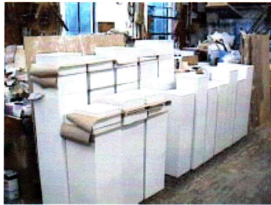
Mike Veno's team of members fabricated display columns for our exhibit