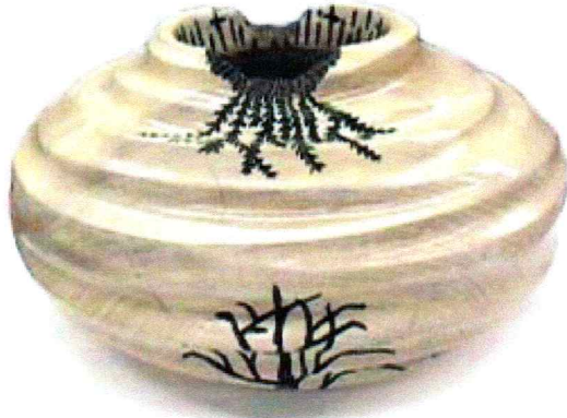
Ken's multiple access turning with carved decorations