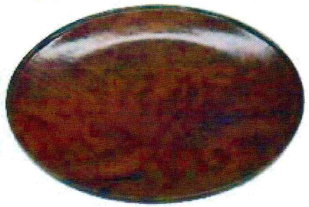
Lenny Langevin's large plate