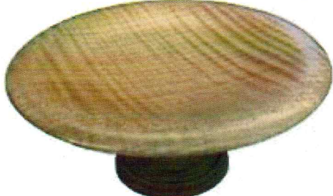
Sid's Curly Maple with Cherry base piece