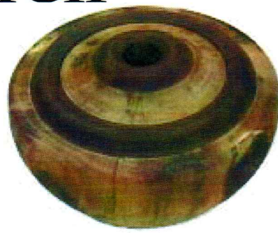
Bernie's Norfolk Island Pine and Walnut piece