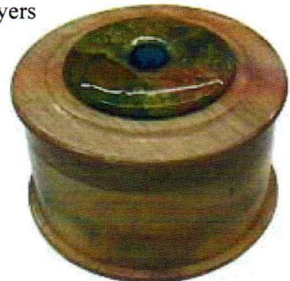
Jeff's Maple box and two bowls