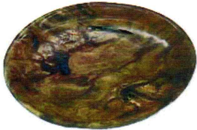
Mystery piece by _____