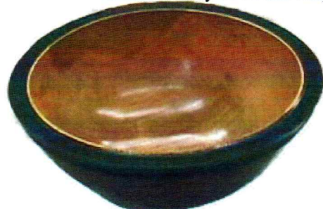
Andy's Maple bowl with black & white trim and decorated plate