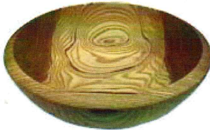
Paul O'Neill's Oak and Maple crotch bowls