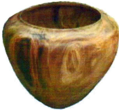
Nigel's bowl turning and Cherry wall sconces