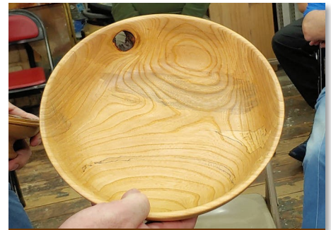
Pictured, is a medium sized SPALTED MAPLE bowl turned by Tim Rix.