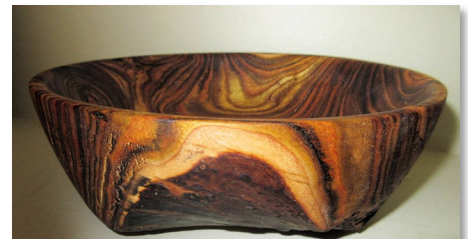
A side view of Bob's SUMAC bowl