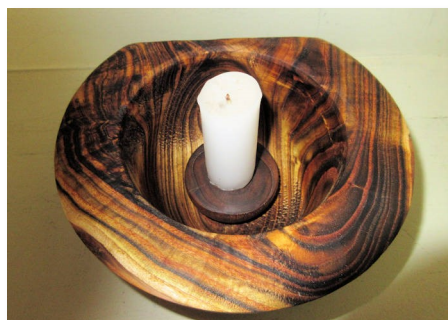
Another view of Bob's SUMAC candle holder.