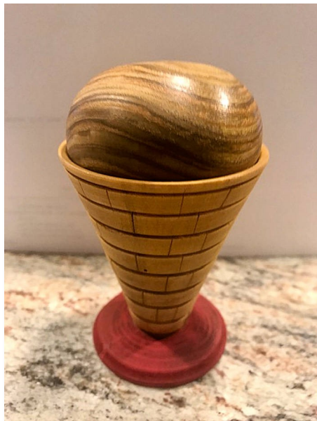
Pictured here is a scoop of SUMAC nestled in a CHERRY cone, the cone has a burned cross pattern and a base of BLOODWOOD.