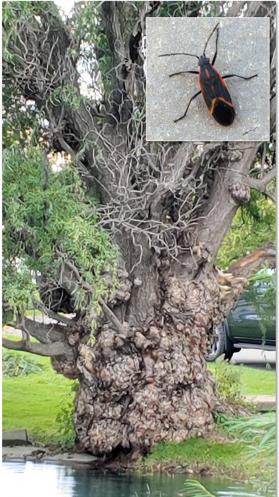
Willow Tree with a great number of burls