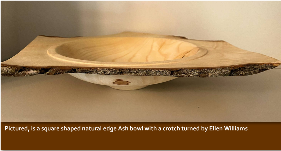
Pictured, is a square shaped natural edge Ash bowl with a crotch turned by Ellen Williams