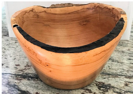
Pictured here is a CHERRY bowl with a natural edge turned by Peter Soltz.