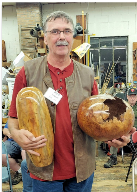
The lighter colored piece is a vase turned from SPALTED MAPLE and finished with WATERLOX in Semigloss