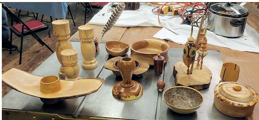
Christmas Gift Swap Items on Display