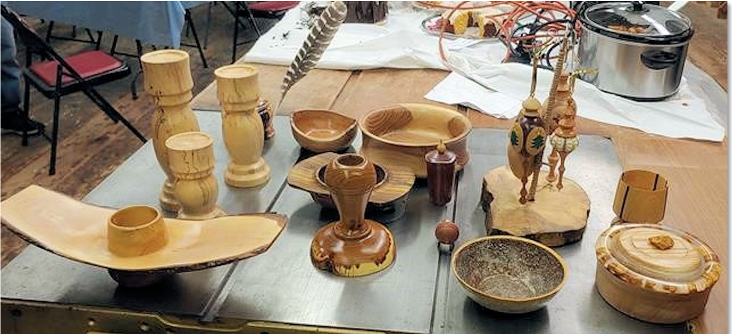
Pictured here and in the surrounding photos, is the collection of gifts to be swapped. On display for all to see.

It was very rewarding to see many newer members participate in the gift swap sharing their work with other club members and trying to guess who turned what piece! The gift swap order was by random drawing of ticket numbers and went like this: