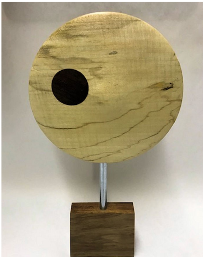
Peter turned this disc mounted on its stand. It features a spalted natural edge. He drilled the hole using a Forstner bit.