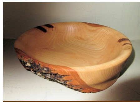
Pictured here, we see an oak platter with some of the bark left on. Also turned by Bob Courchesne