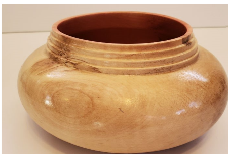
Andy turned this Maple container dyed red inside, 4" by 7".