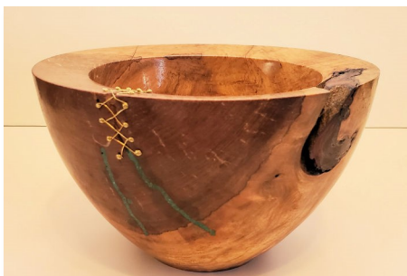
Pictured here, "Brother Danny", 5" by 8" which was cored from Arnold, both names from the lead actors in the movie, "Twins"