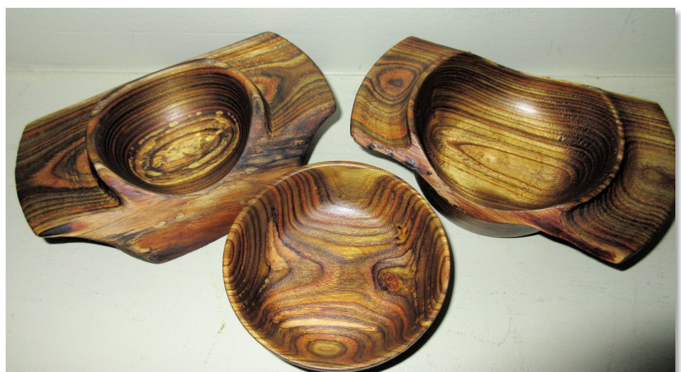
3 pieces turned from sumac by Bob Courchesne and finished with walnut oil.