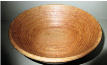
Bob Courchesne showed us this honey locust bowl. It measures 3" by 7 1/4".