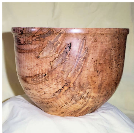
The spalted Maple bowl measures 7" deep with a 10" circumference.