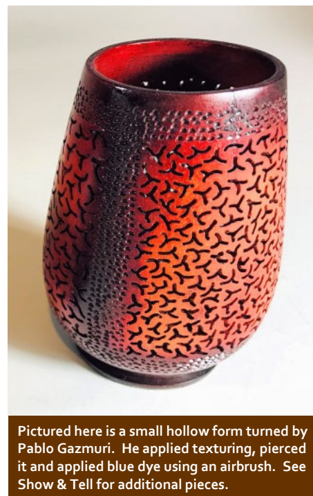
Pictured here is a small hollow form turned by Pablo Gazmuri. He applied texturing, pierced it and applied blue dye using an airbrush. See Show & Tell for additional pieces.