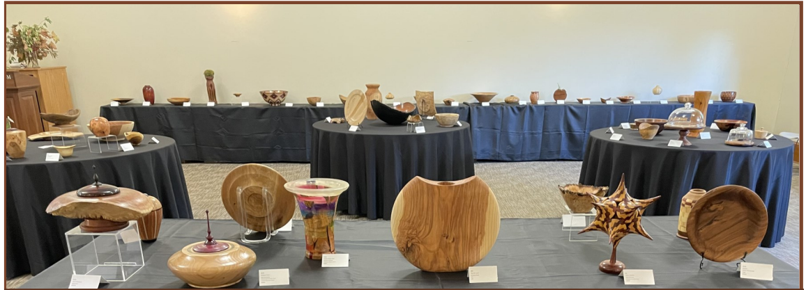
Pictured are some of the turned items on display at the Arnold Arboretum's 125th anniversary show that was held October 7th through the 9th in Jamaica Plain.