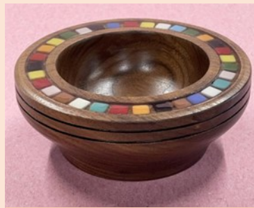
Charlie McCarthy Walnut Bowl with Resin Rim