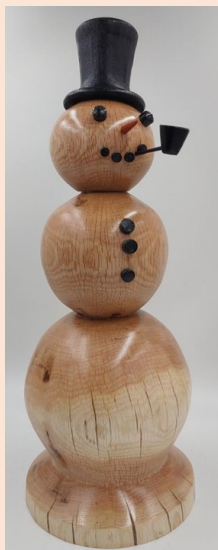
Joe Centorino 22" Oak Snowman (features created with Ebonized Oak)