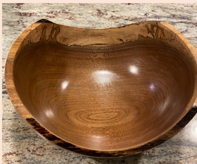
Peter Soltz - Black Walnut Natural Edge Bowl