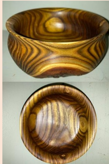
Bob Courchesne - 5 1/2" x 2 1/2" Sumac with Mahoney's Utility Oil