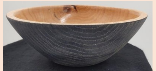
Joe Centorino Ebonized Oak Bowl with Liming Wax Finish