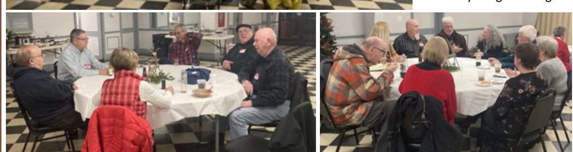
This year's venue was more conducive to comfort and social interaction