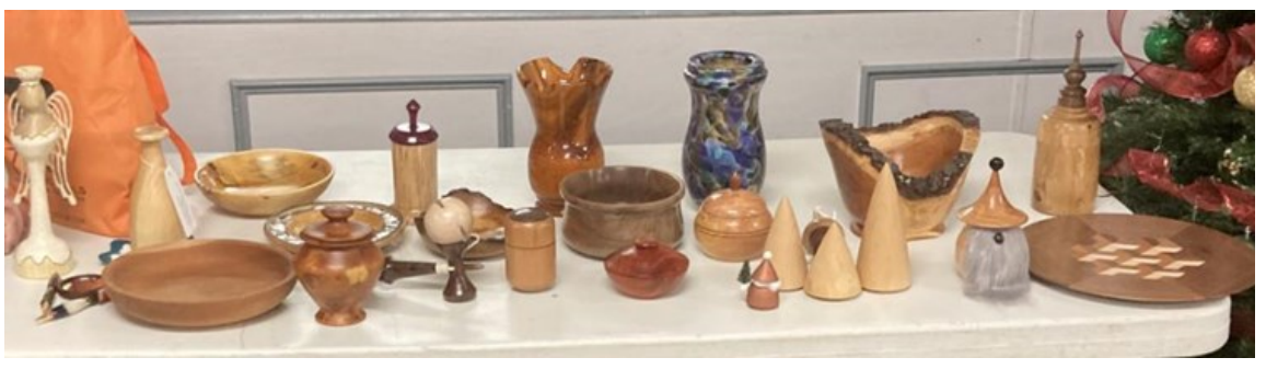
In all, 26 members participated in the this year's grab!