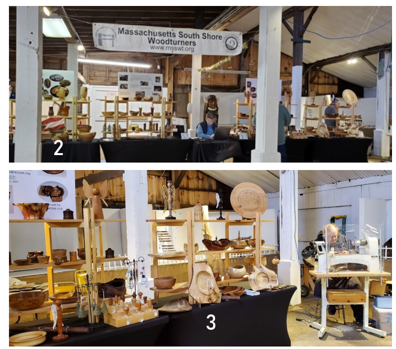
(1) Melissa Fantasia turns tops; (2) Four display tables with turned items from 13 members; (3) John Shooshan anchors the 2nd demo; (4) & (5) closer view of turned items for sale.

I'm sure we will be welcomed back for future Marshfield Farmers' Market events.