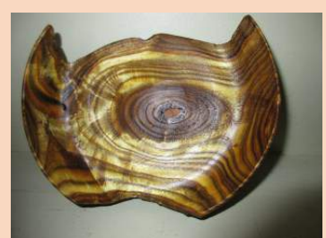
Live edge Sumac dish 1 3/4" x 4 1/4" x 6" Mahoney's Oil Wax Finish... Mother Nature's true beauty