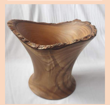
Live edge crotch vase 6" x 7" finished in Danish oil. Not sure of the species, maybe black gum?