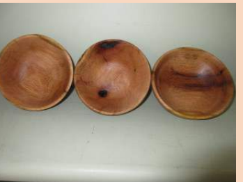
Spalted Ambrosia White Oak 2" x 5" Mahoney's Oil Wax finish