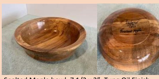
Spalted Maple bowl, 7 1/2 x 3", Tung Oil Finish