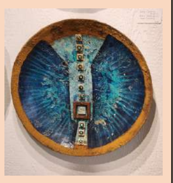
Left 2 — Andy's work Right 2—Pieces from art show in AZ